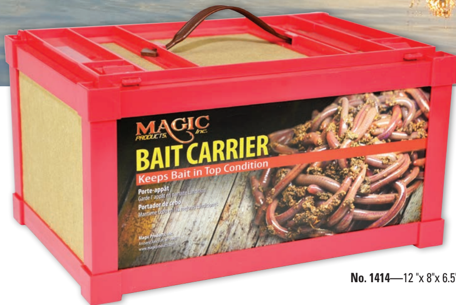
No. 1414 —12" x 8" x 6.5"