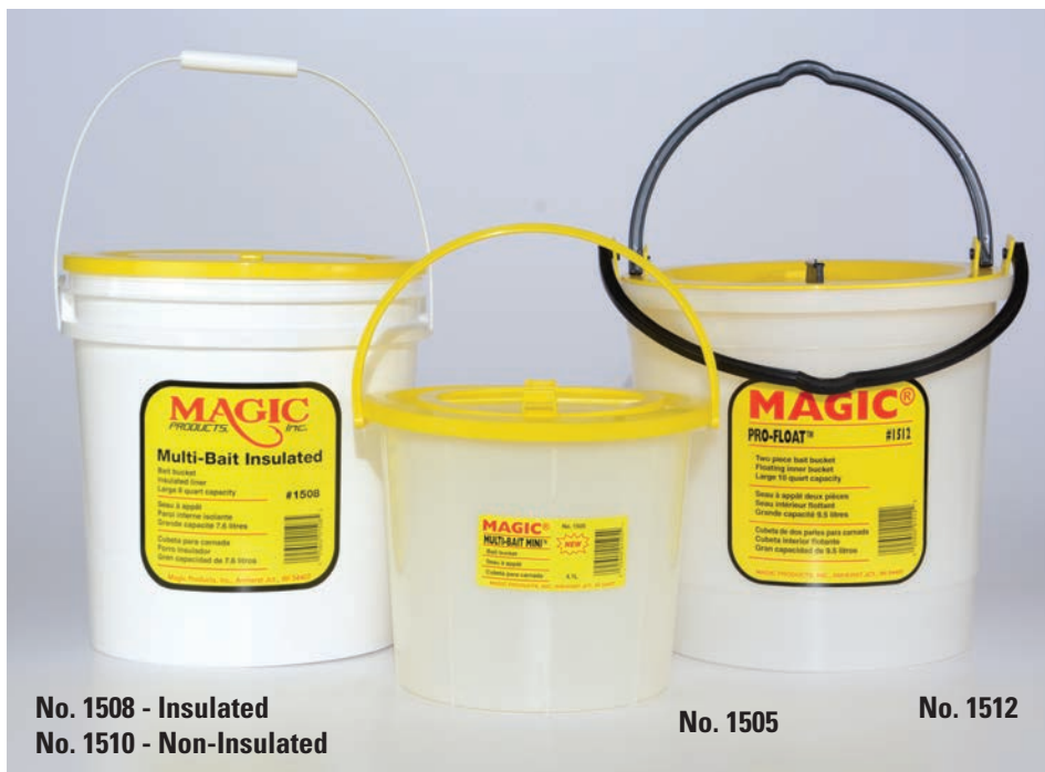
No. 1508 - Insulated No. 1510 - Non-Insulated