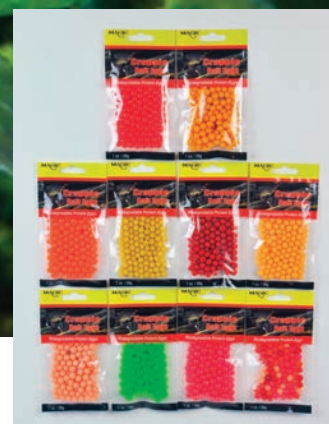
Crappie Bait Eggs