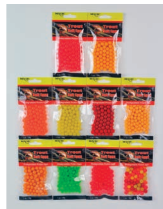
Trout Bait Eggs

Simulated eggs made of biodegradable protein. Clean and easy to use. Stays on hook. Retains color and flavor while slowly releasing scent into water. In a recloseable 1 oz bag. Formulated for Crappie, Salmon or Trout Fishing.