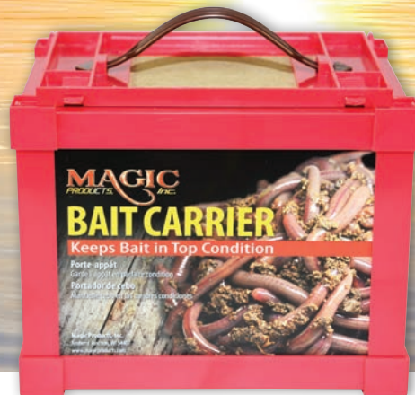
No. 1407 —8" x 6" x 6.5"