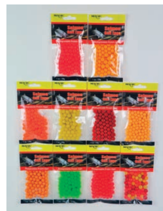
Salmon Bait Eggs