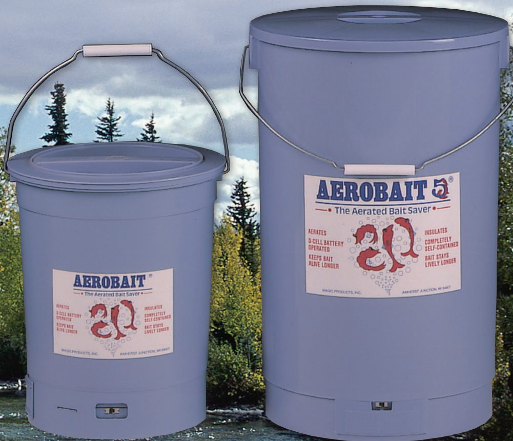
No. 2101 7 Quart Height 12½" Diameter 10"