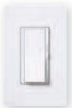
Diva® C•L™ Gloss and Satin Colors®