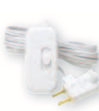
Credenza® C•L™ Black (BL), White (WH), and Brown (BR)