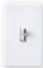
Ariadni® C•L™ Gloss colors Coming Soon