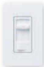
Skylark Contour™ C•L™* Gloss colors