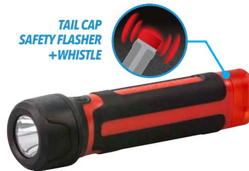
TAIL CAP SAFETY FLASHER + WHISTLE