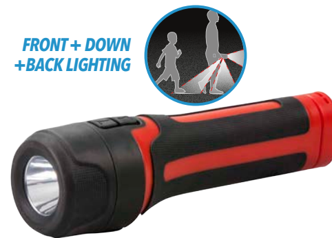
FRONT + DOWN + BACK LIGHTING