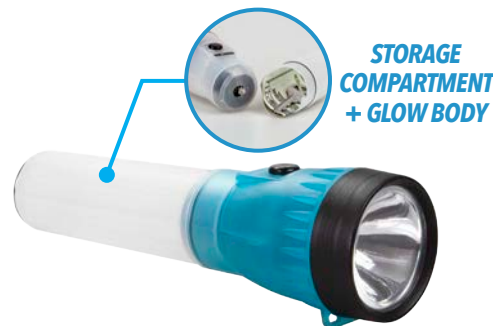
STORAGE COMPARTMENT + GLOW BODY