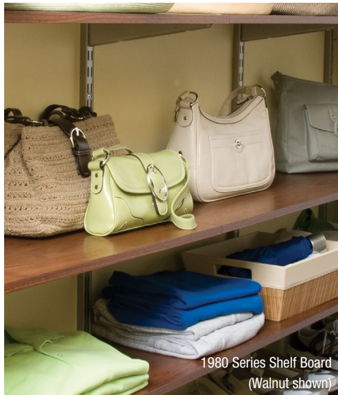
1980 Series Shelf Board (Walnut shown)