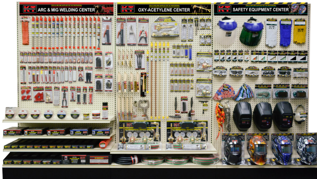
8' Set Model # 130-72302