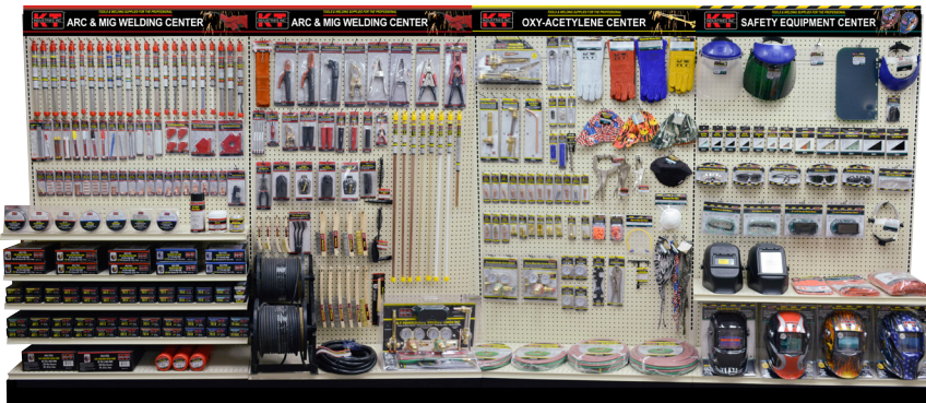
12' Set Model # 130-72303