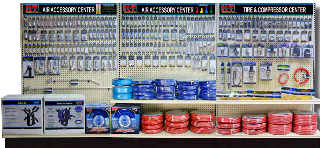
12' x 60" Master Air Accessory Display Model No. 130-60112

Providing you with programs and tools to increase volume and sales goals