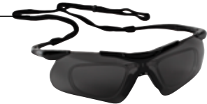
Every pair includes a neck cord for reduced risk of damage when not being worn