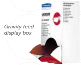
Gravity feed display box