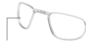
RX prescription insert