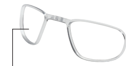
RX prescription insert