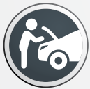
General automotive repair