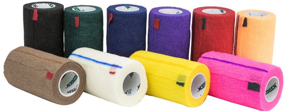
TA3400 assorted colors