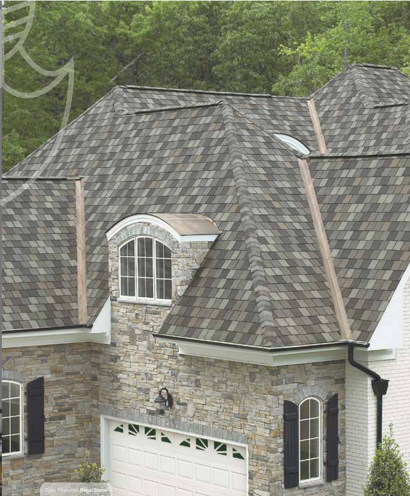
Color Featured: Regal Stone