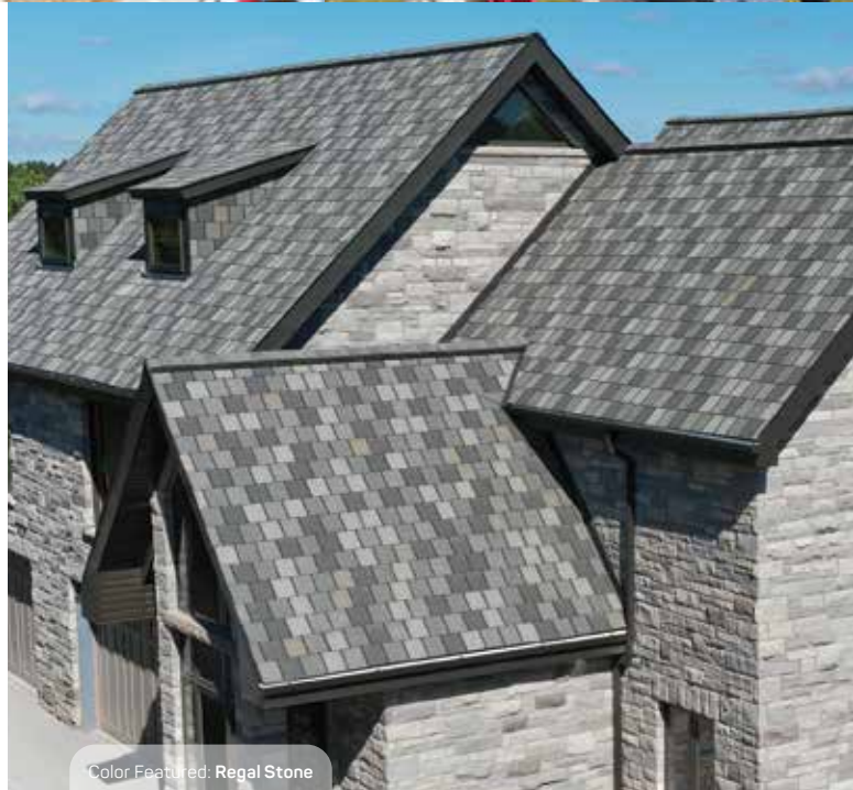
Color Featured: Regal Stone

Two stunning color blends to tempt you. Each color blend is a visual symphony of individual color tones that emulate the natural variations of designer slate. In concert with the extra-large exposure of these shingles, your roof will be "slated" to stir the senses like never before. The affordable price will be music to your ears too.