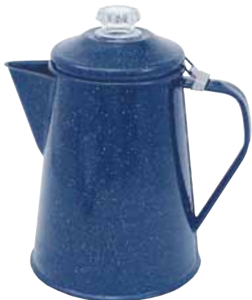
Coffee Percolator F0224 2 Quart Blue