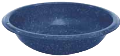
Wash Basin F6432 4 Quart Blue