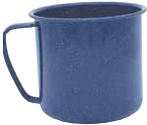
Straight Cup F6702 2 Quart Blue