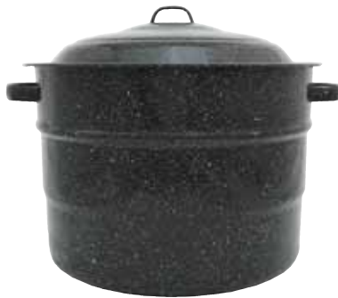
Canner with Jar Rack Rack holds 7 one quart jars. Jars not included F0707 21 1/2 Quart Black