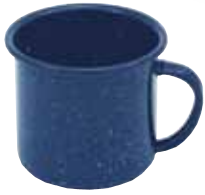
Mug F0219 12 oz. Blue

Functional, durable and right at home in any cabin, campsite or cookout.