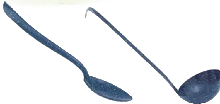
Spoon F0274 12" Blue