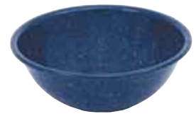
Bowl F0218 6" (20 oz.) Blue