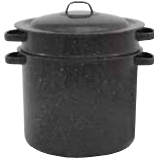
Blancher with Drainer Insert F6140 7 1/2 Quart Black