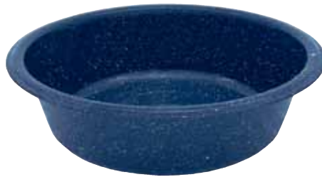
Dish Pan F6414 10 Quart Blue