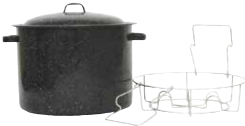
Mini Canner with Jar Rack Just right for jams, jellies and salsa. Rack holds 7 one pint jars. Jars not included F0706 11 1/2 Quart Black