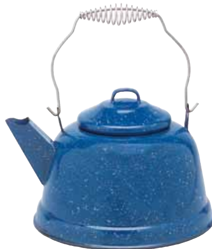
Tea Kettle F6263 3 Quart Blue