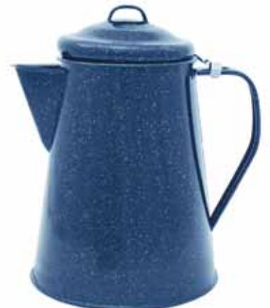
Coffee Boiler F6700 2 ¾ Quart Blue F6006 3 Quart Black