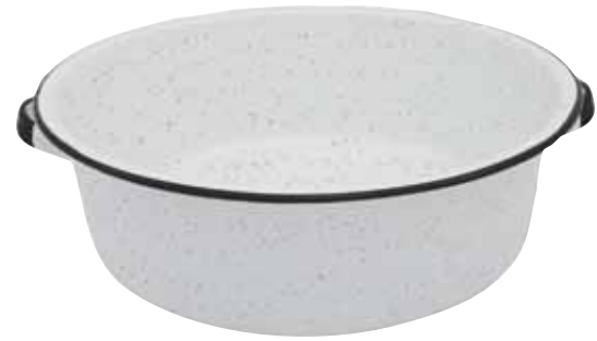
Dish Pan with Handles F6415 15 Quart Blue F6416 15 Quart White