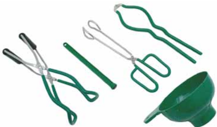
5 pc. Canning Set Set includes; Jar Lifter, Magnetic Lid Lifter, Kitchen Tongs, Jar Wrench and Jar Funnel. F0717 5 pc. Set