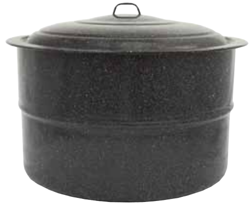
Canner with Jar Rack Great for preserving tomatoes and fruit. Rack holds 9 one quart jars. Jars not included F0709 33 Quart Black