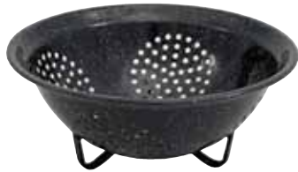
Colander F0713 9" Black

Canning is an economical way to preserve fresh quality foods at home while retaining their important vitamins and nutrients. The right equipment is essential to ensure a quality product and Granite•Ware offers all the basics for blanching produce for the freezer or for cold pack canning.