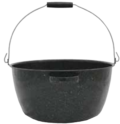
Preserving Kettle with Handle F0704 16 Quart Black