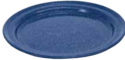
Plate F0217 10" Blue