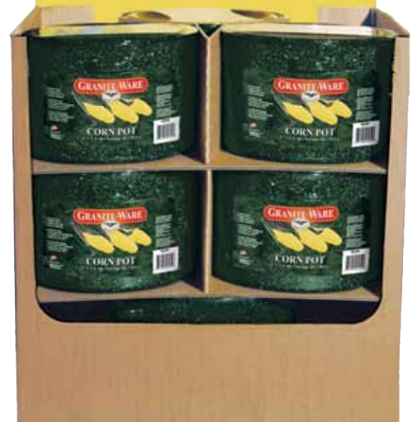
6134-9 Corn Pot Display

Great for chili, gumbo, soups, stews & seafood. F6136 19 Quart Black F6125 21 Quart Black F6139 34 Quart Black F6127 50 Quart Black