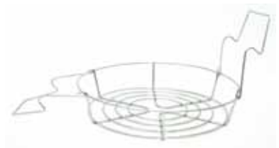
Canner Jar Racks F0714 Fits 11 1/2 Qt. Canner (0706) Holds 7 one pint jars. (Not Included) F0715 Fits 21 1/2 Qt. Canner (0707) Holds 7 one quart jars. (Not Included) F0716 Fits 33 Qt. Canner (0709) Holds 9 one quart jars. (Not Included)