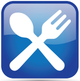
Food Service & Preparation

These helpful icons will show you the best glove products for your needs.