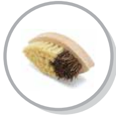
Tampico fiber bristles

74907 4.5" / Beechwood with tampico and bassine fiber Card, 12 per case 0-30734-74907-4