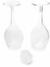
WINE GLASS OIL & VINEGAR BOTTLE SET