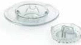
SINKTASTIC STRAINER & STOPPER