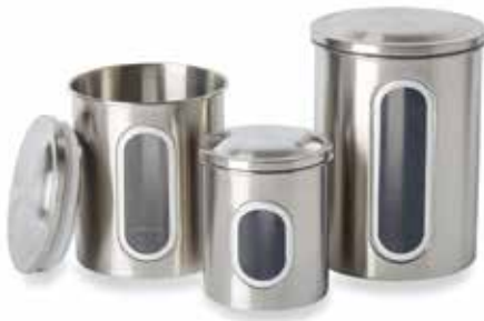
STAINLESS STEEL CANISTER SET (3 PIECE)