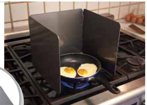
Panels fold together for flat, easy storage