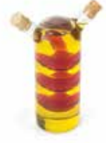
OIL & VINEGAR BOTTLE