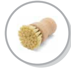
Tampico fiber bristles

74908 3" / Beechwood with tampico fiber Card, 12 per case 0-30734-74908-1