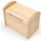
RECIPE CARD BOX

4049 UPC Sticker, 12 per case 0-30734-04049-2