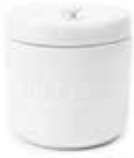
PORCELAIN GREASE CONTAINER