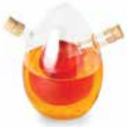
GLASS OIL & VINEGAR BOTTLE