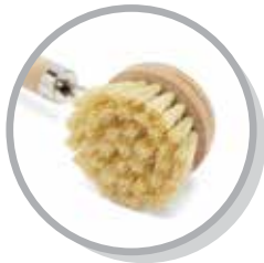
Tampico fiber bristles