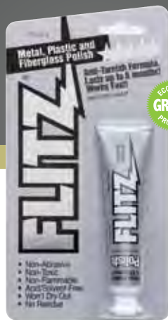
Item BP 03511: 50 gr / 1.76 oz Blister Tube