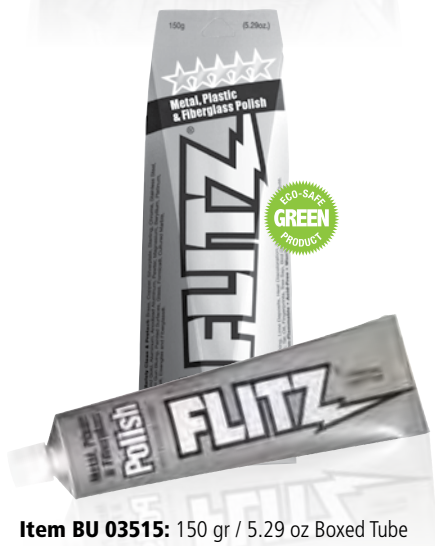
Item BU 03515: 150 gr / 5.29 oz Boxed Tube