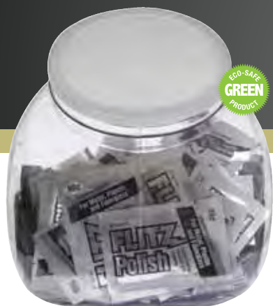
Item FB TS 010-100: 2 gr / .07 oz Packet in Jar Display

Protects up to 6 months in freshwater and 3 months in saltwater. Results Guaranteed or you money back.