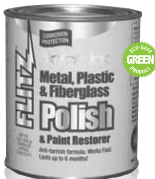
Item CA 03518-6: 906 gr / 2.0 lb Quart Can