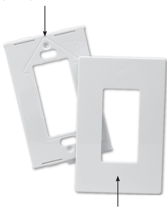
Screwless wallplates clip easily into place with gentle pressure and no visible screws

Clearly marked top edges makes mounting plate easy to orient and attach