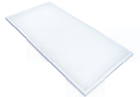
2' X 4' Premium Flat Panel