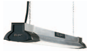
Shop Light with Bluetooth Speakers