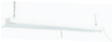
Linkable Shop Light