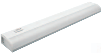
Linkable Under Cabinet Light