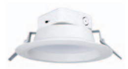
8in. High Output Downlight