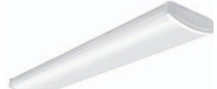
4ft. High Lumen Output Wrap Light