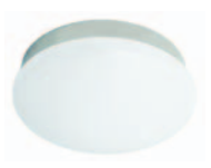
11in. Spin Light