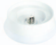
7in. Spin Light