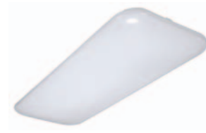
Traditional Smooth Lens