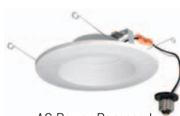
AC Power Recessed Retrofit Downlight Kit