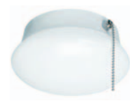
7in. Spin Light with pull chain