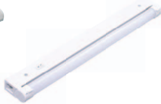
Linkable, Beam Adjustable Under Cabinet Light