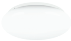
12in. & 16in. Low Profile