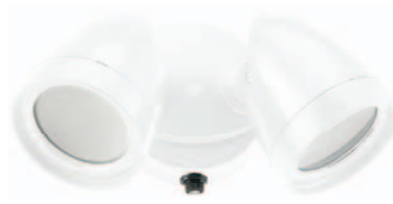
White Security Light