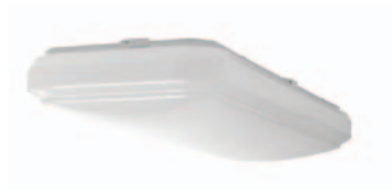
Reva Stepped Lens