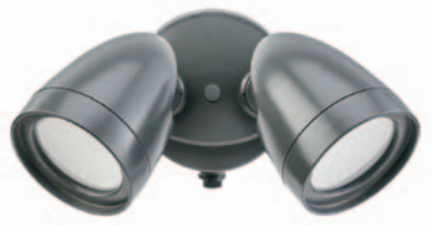
Dark Bronze Security Light