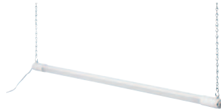
Shop Light Bar