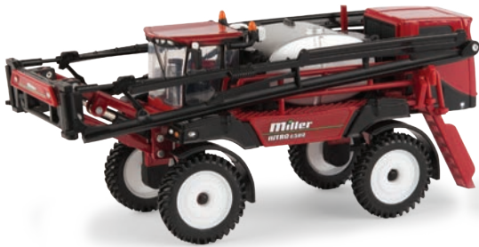
1:64 Miller Nitro 6500 Sprayer Part No. ZFN16352 Pack: 12 - Age grade 8+ - While supplies last Die-cast frame and engine cover, boom arms raise and lower. Boom arms fold out to spraying position.