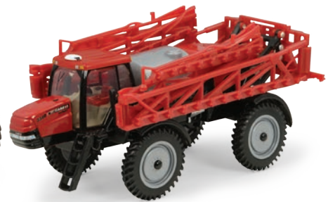
1:64 Patriot® 3340 Sprayer Part No. ZFN14876 Pack: 12 - Age grade 8+ Boom arms fold out to spraying position, boom arms raise and lower.