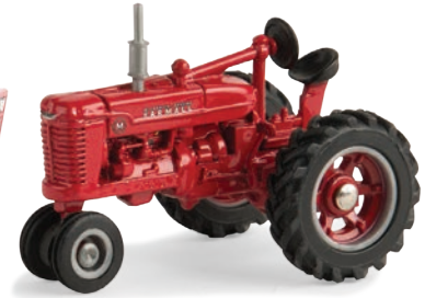
1:64 Farmall® M Part No. ZFN44079 Pack: 12 - Age grade 3+ Die-cast body and front axle, hitch fits most 1:64 implements.