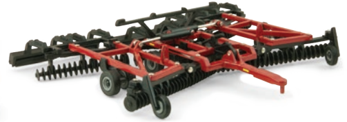
1:64 330 Turbo Disk Part No. ZFN14850 Pack: 12 - Age grade 3+ Die-cast frame. Folding left and right frame wings.