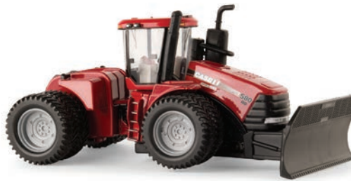
1:64 Steiger® 580 with Grouser® Blade Part No. ZFN14907 Pack: 12 - Age grade 3+ - While supplies last Front Grouser® blade, front and rear duals, articulated, detailed interior, rear weights, cab and rear fender lights.