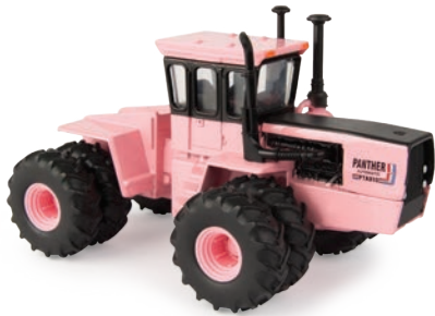
1:64 Pink Steiger® Panther PTA 310 Series III Part No. ZFN14702 Pack: 12 - Age grade 3+ Die-cast body and front and rear duals.