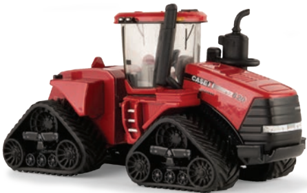
1:64 Steiger® 620 Quadtrac® Part No. ZFN14908 Pack: 12 - Age grade 3+ Articulated, detailed interior, rear weights, cab and rear fender lights.