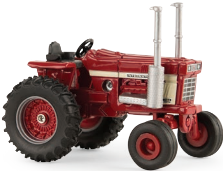
1:64 IH 1568 V8 Part No. ZFN14964 Pack: 12 - Age grade 3+ Die-cast body and front axle. Oscillating front axle.