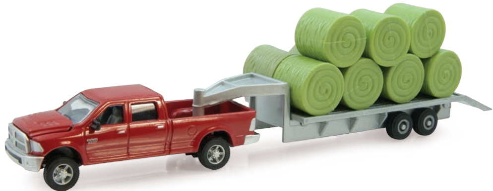
1:64 Ram® Pickup with Gooseneck Flatbed Trailer with Round Bales Part No. ZFN14855 Pack: 12 - Age grade 3+ Die-cast pickup body and Die-cast trailer frame.