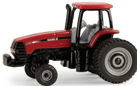
1:64 Magnum™ MX220 Part No. ZFN14963 Pack: 12 - Age grade 3+ - While supplies last - OPPORTUNITY BUY Two wheel drive, rear row crop duals, hitch fits most 1:64 implements.