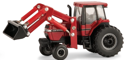
1:64 Magnum™ 7110 with Loader Part No. ZFN14930 Pack: 12 - Age grade 3+ Die-cast loader, boom arms raise and lower. Die-cast bucket pivots to unload.