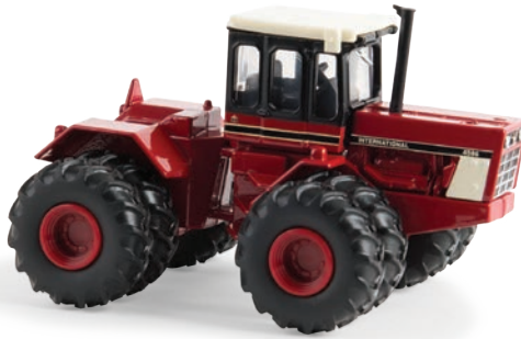
1:64 IH 4586 Part No. ZFN14944 Pack: 12 - Age grade 3+ Articulated die-cast front and rear body.