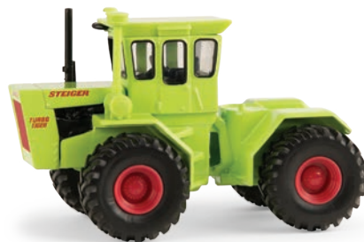
1:64 Steiger® Turbo Tiger I Series I Part No. ZFN14967 Pack: 12 - Age grade 3+ - While supplies last - OPPORTUNITY BUY Articulated, die-cast body, clear windows, detailed interior.