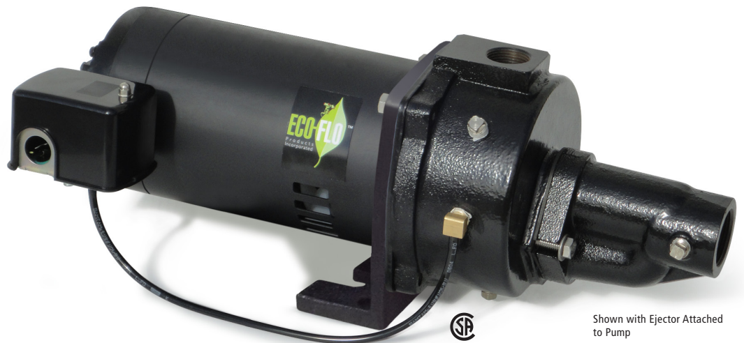
Shown with Ejector Attached to Pump