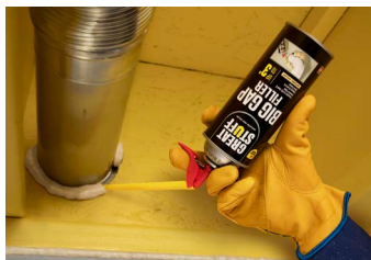
Hard to Reach Spaces