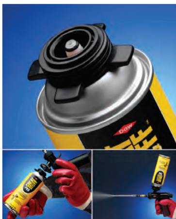
Attach gun to can.