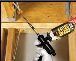
Electrical wire penetration