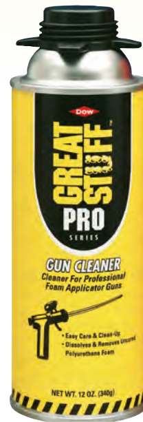
Clean residual uncured foam from inside of gun.