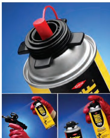
Remove uncured foam from gun.