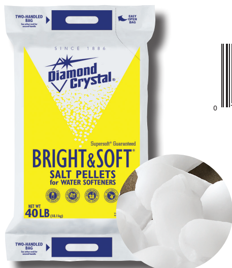
Product appearance may vary slightly based on production location.

* All specifications are approximate. Please contact your broker or Cargill representative for exact specifications. Package dimensions are for filled area of packaging and do not include the flat handle portion of the bags.