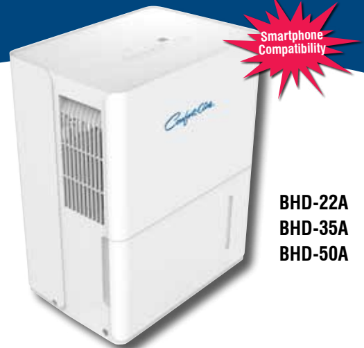
BHD-22A BHD-35A BHD-50A