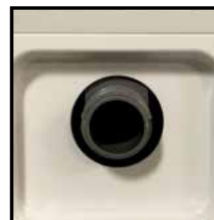
Optional Direct Drain Connection