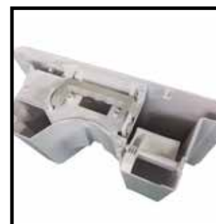
Convenient Drain Bucket