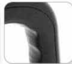
Comfortable Stay Cool Handle