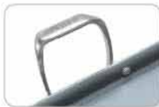
Unique offset handles