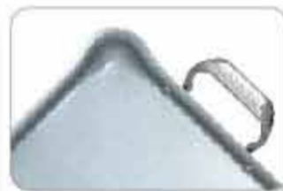
Available without PFOA and PFOS nonstick coating or stainless steel

Excellent for pancakes, bacon, burgers, quesadillas and more! Stovetop and oven safe up to 500°F/260°C.