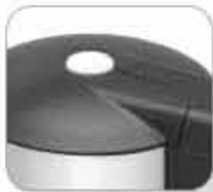
Lid Open Button