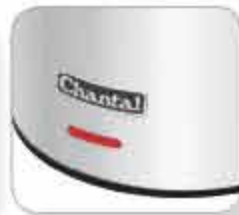
Indicator Light Illuminates While Kettle is heating