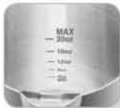
Water Level Gauge

All Stainless Steel Interior • BPA-Free! Perfect for Small Spaces!