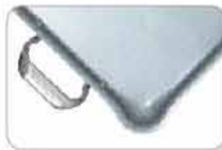
Convenient pouring spout