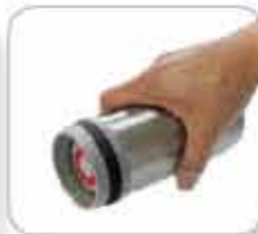
No spill silicone seals