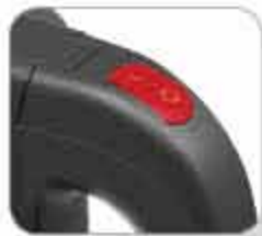
Automatic OFF Switch