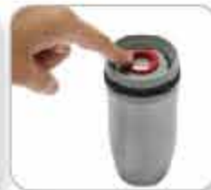
Push button to open and drink from any side