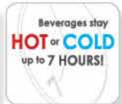
Copper layer allows beverages to stay HOT or COLD for up to 7 HOURS!