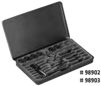
# 98902 # 98903