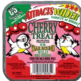
535 • 11 3 / 4 oz. • 12/cs. Cherry Treat