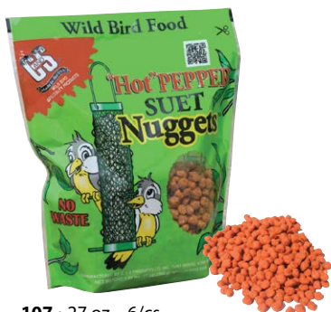
107 • 27 oz. • 6/cs. "Hot" Pepper Suet Nuggets™