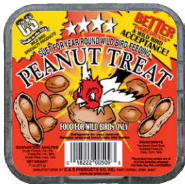
509 • 11 oz. • 12/cs. Peanut Treat

FLAVORED PELLETS MAKE THESE PRODUCTS A FAVORITE FOR ALL BIRDS