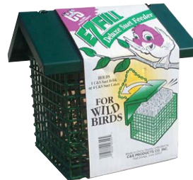
729 • 6/cs. EZ Fill Deluxe Suet Feeder with Roof 6" x 6 3 / 8 " x 6 3 / 8 " high Holds 4 Cakes