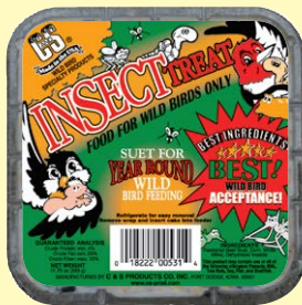
531 • 11 3 / 4 oz. • 12/cs. Insect Treat