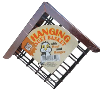
709 • 6/cs. Hanging Suet Basket with Roof 2" x 8" x 7" high Holds 1 Cake