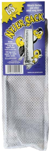
950 • 24/cs. Njer® Sack 3 3 / 4 " x 12 1 / 2 " high Holds 8 oz. Includes 2 clip strips