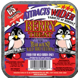
527 • 11 3 / 4 oz. • 12/cs. Berry Treat