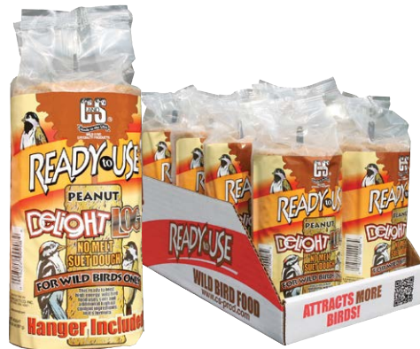
908 • 2 lbs. • 8/cs. Peanut Delight Log