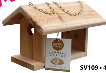
SV109 • 4/cs. Bluebird Feeder 11 7 / 8 " x 9" x 8" high