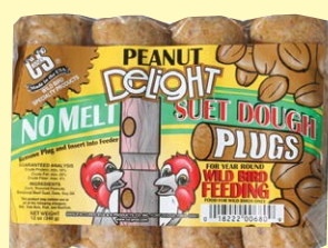
680 • 12 oz. • 4 pack • 12/cs. Peanut Delight No Melt Plug