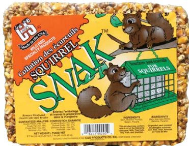
205 • 2.7 lbs. • 6/cs. Squirrel Snak™ 2 1/4" x 7 5/8" x 6 1/4" high