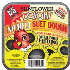
565 • 11 3 / 4 oz. • 12/cs. Sunflower Delight