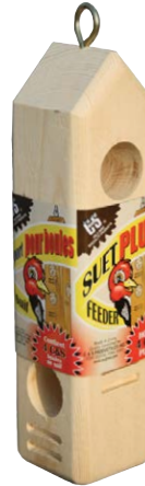
770 • 6/cs. Suet Plug Feeder Holds 4 plugs 3" x 3" x 12 3 / 4 " high

C&S warrants its feeder products to be free from manufactures defects when used according to its directions and intended purpose for a period of 90 days from the date of purchase. Warranty claims are to be made directly by the consumer to C&S's Customer Service Department at 1-800-373-2425.