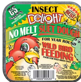
533 • 11 3 / 4 oz. • 12/cs. Insect Delight