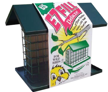
750 • 4/cs. EZ Fill Deluxe Snak™/Suet Feeder with Roof + Platform 8" x 10 3 / 4 " x 7 3 / 8 " high Holds 1 Large Snak™ or up to 56 oz. of Suet

C&S warrants its feeder products to be free from manufactures defects when used according to its directions and intended purpose for a period of 90 days from the date of purchase. Warranty claims are to be made directly by the consumer to C&S's Customer Service Department at 1-800-373-2425.