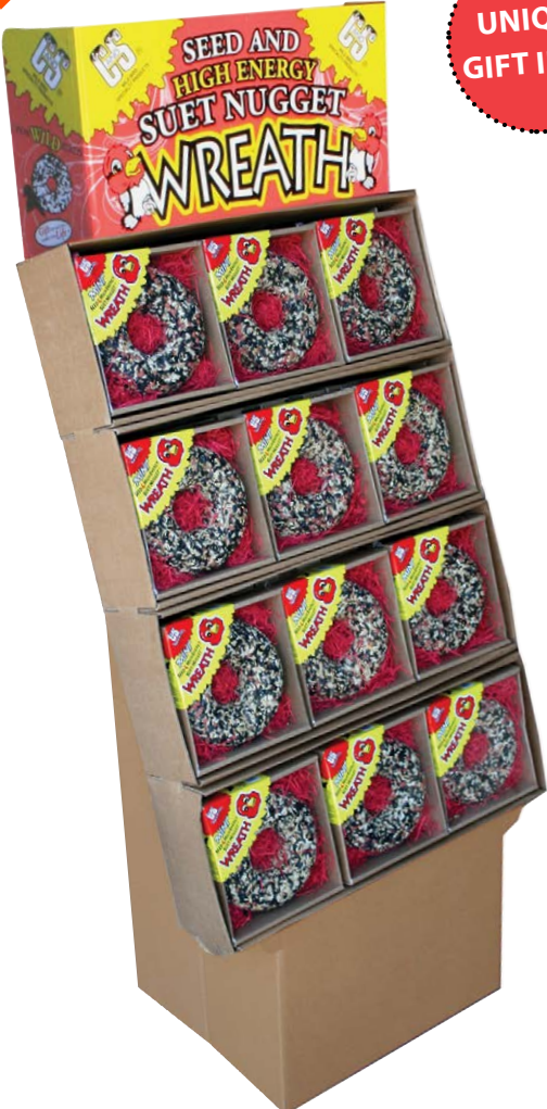
PP18 Mini Suet Nugget™ Wreath Display 17 1/2" d x 25 3/4" w x 64 1/2" h