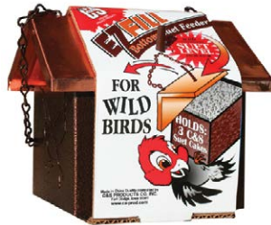
727 • 6/cs. EZ Fill Bottom Suet Feeder 5 1 / 2 " x 6 1 / 2 " x 5 3 / 4 " high Holds 3 Cakes