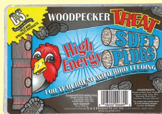
689 • 11 oz. • 4 pack • 12/cs. Woodpecker Treat Suet Plug