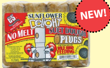
665 • 12 oz. • 4 pack • 12/cs. Sunflower Delight No Melt Plug