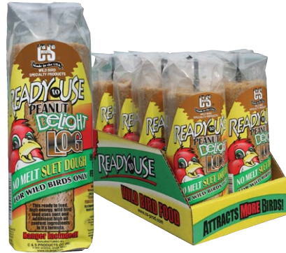
907 • 16 oz. • 8/cs. Peanut Delight Log