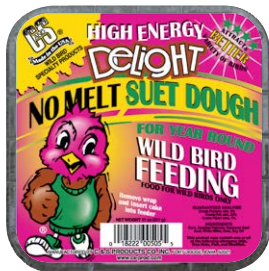
505 • 11 oz. • 12/cs. High Energy Delight