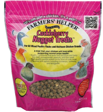
338 • 27 oz. • 6/cs. Farmers' Helper™ Cackleberry Nugget Treats™