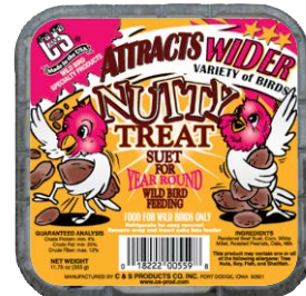
559 • 11 3 / 4 oz. • 12/cs. Nutty Treat