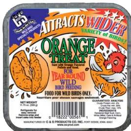
561 • 11 3 / 4 oz. • 12/cs. Orange Treat

BIRDS ENJOY OUR MANY FLAVORS OF SUET YEAR ROUND