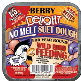
543 • 11 3 / 4 oz. • 12/cs. Berry Delight