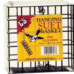
707 • 8/cs. Double Suet Basket 2 3 / 4 " x 5 1 / 4 " x 5 1 / 8 " high Holds 2 Cakes