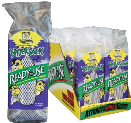
951 • 12 oz. • 8/cs. Nyjer® Sack