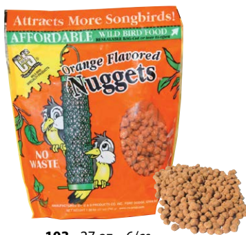
103 • 27 oz. • 6/cs. Orange Flavored Nuggets™