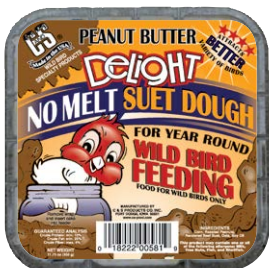
581 • 11 3 / 4 oz. • 12/cs. Peanut Butter Delight