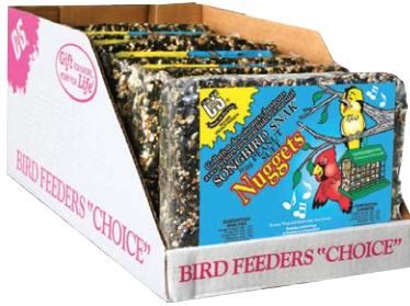
SNAK™ CASE OF 6