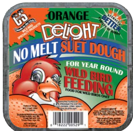
529 • 11 3 / 4 oz. • 12/cs. Orange Delight