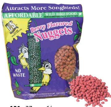
101 • 27 oz. • 6/cs. Berry Flavored Nuggets™