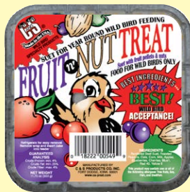
549 • 11 3 / 4 oz. • 12/cs. Fruit n' Nut Treat