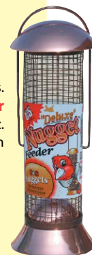
757 • 8/cs. Deluxe Nugget™ Feeder Holds up to 15 oz. 3 7 / 8 " x 3 7 / 8 " x 10 1 / 2 " high