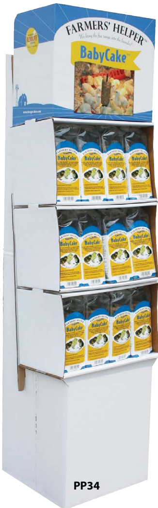
12 3 / 8 " d x 13 3 / 4 " w x 53" h