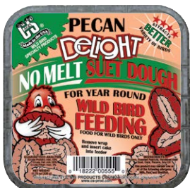
555 • 11 3 / 4 oz. • 12/cs. Pecan Delight