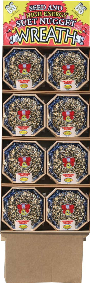
PP17 Suet Nugget™ Wreath Display 17 1/2" d x 21 3/4" w x 70" h