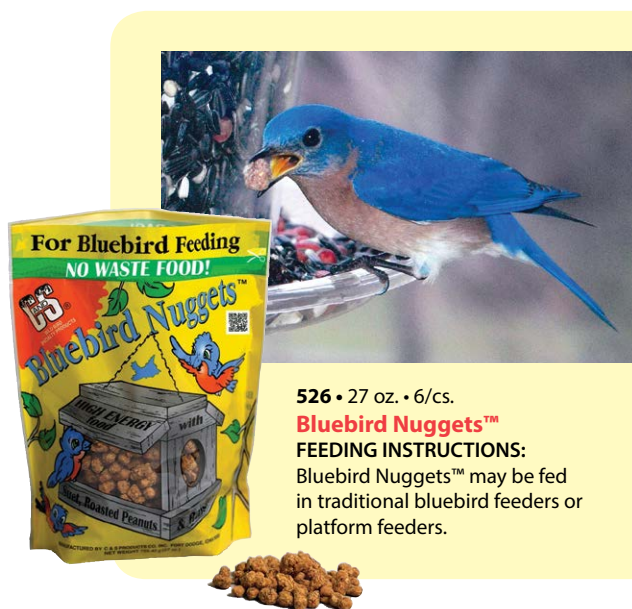
526 • 27 oz. • 6/cs. Bluebird Nuggets™ FEEDING INSTRUCTIONS: Bluebird Nuggets™ may be fed in traditional bluebird feeders or platform feeders.