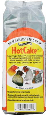
383 • 15 oz. • 8/cs. Farmers' Helper™ HotCake™