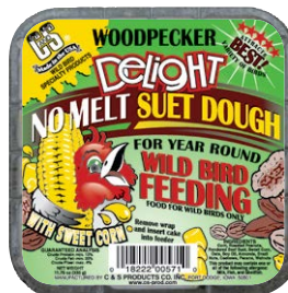
571 • 11 3 / 4 oz. • 12/cs. Woodpecker Delight