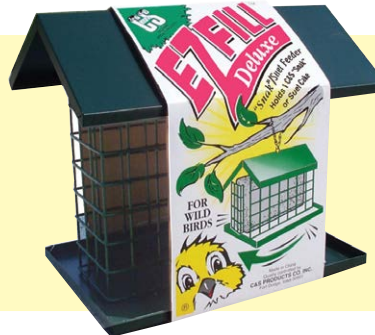
750 • 4/cs. EZ Fill Deluxe Snak™/Suet Feeder with Roof + Platform 8" x 10 3/4" x 7 3/8" high Holds 1 Large Snak™ or up to 56 oz. of Suet