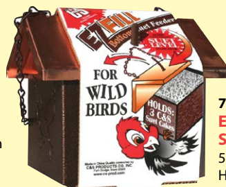
727 • 6/cs. EZ Fill Bottom Suet Feeder 5 1 / 2 " x 6 1 / 2 " x 5 3 / 4 " high Holds 3 Cakes