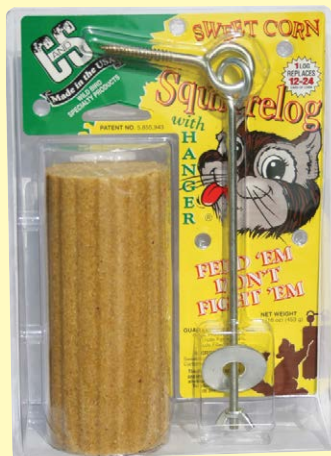
610 • 12/cs. Sweet Corn Squirrellog™ with Hanger