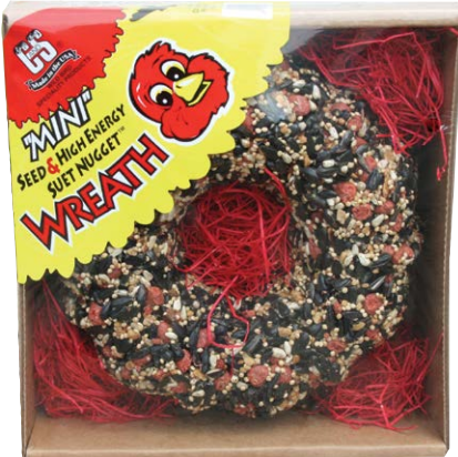
246 • 1.7 lbs. • 6/cs. Mini Suet Nugget™ Wreath 2 3/4" x 8 3/8" x 8 5/8" high