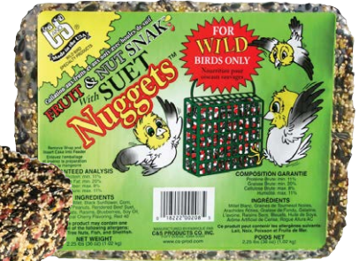
208 • 2.25 lbs. • 6/cs. Fruit & Nut Snak™ with Suet Nuggets™ 2 1/4" x 7 5/8" x 6 1/4" high