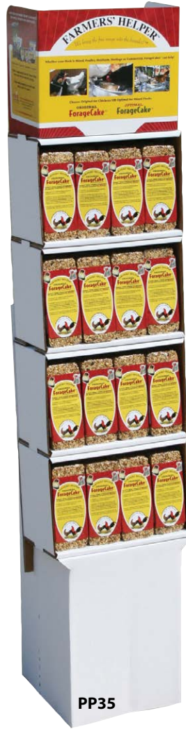
11 3 / 8 " d x 12 1 / 4 " w x 58 1 / 8 " h