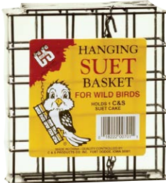
701 • 8/cs. Single Suet Basket 1 3 / 4 " x 4 7 / 8 " x 5 1 / 8 " high Holds 1 Cake 1" black wire