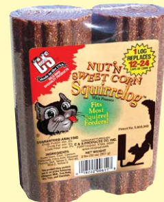
611 • 32 oz. Nut 'N Sweet Corn Squirrellog™ Refill 2/pack • 12/cs.