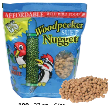
109 • 27 oz. • 6/cs. Woodpecker Suet Nuggets™