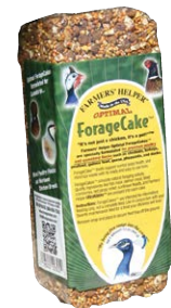
302 • 13 oz. • 8/cs. Farmers' Helper™ Optimal ForageCake™