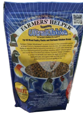
331 • 28 oz. • 6/cs. Farmers' Helper™ UltraKibble™