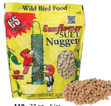
110 • 27 oz. • 6/cs. Sunflower Suet Nuggets™