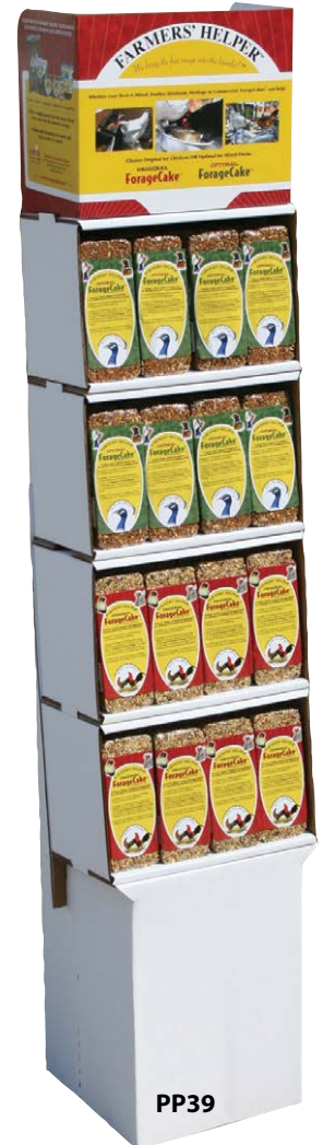
11 3 / 8 " d x 12 1 / 4 " w x 58 1 / 8 " h