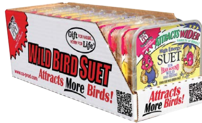
SUET TREAT CASE OF 12