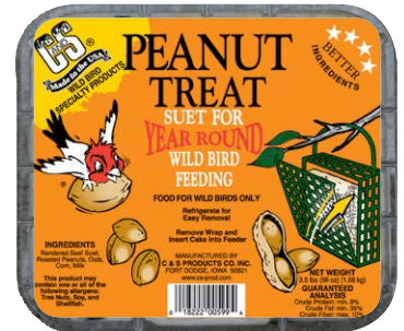
599 • 56 oz. • 6/cs. Peanut Treat Large Cake