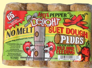
683 • 12 oz. • 4 pack • 12/cs. Hot Pepper Delight No Melt Plug