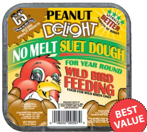
507 • 11 3 / 4 oz. • 12/cs. Peanut Delight