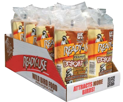
READY TO USE CASE OF 8