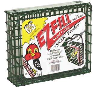
749 • 6/cs. EZ Fill Seed Cake Snak™ Feeder 2 3 / 4 " x 8 3 / 8 " x 7" high Holds 1 Large Snak™ or up to 56 oz. of Suet