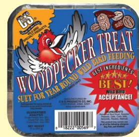
569 • 11 oz. • 12/cs. Woodpecker Treat