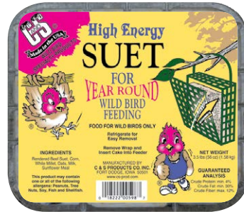
598 • 56 oz. • 6/cs. High Energy Large Cake