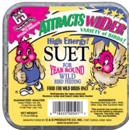
501 • 11 3 / 4 oz. • 12/cs. High Energy Suet