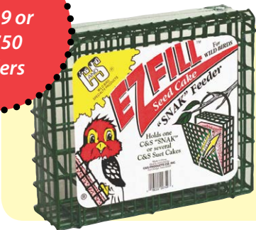
749 • 6/cs. EZ Fill Seed Cake Snak™ Feeder 2 3/4" x 8 3/8" x 7" high Holds 1 Large Snak™ or up to 56 oz. of Suet