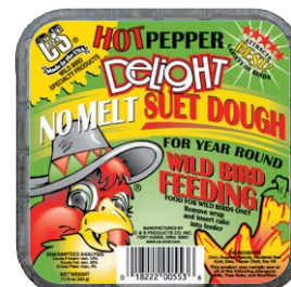
553 • 11 3 / 4 oz. • 12/cs. Hot Pepper Delight