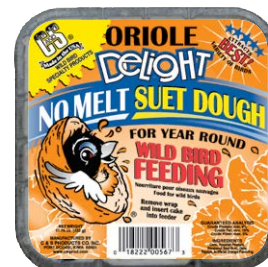
567 • 11 3 / 4 oz. • 12/cs. Oriole Delight