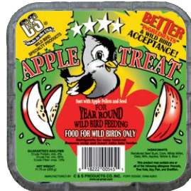
545 • 11 3 / 4 oz. • 12/cs. Apple Treat