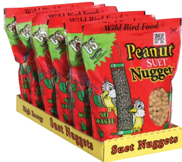
NUGGETS™ CASE OF 6