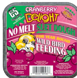
566 • 11 3 / 4 oz. • 12/cs. Cranberry Delight