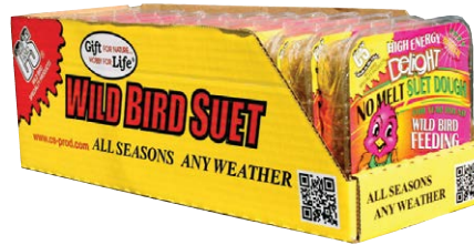
SUET DOUGH CASE OF 12