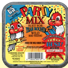
513 • 11 oz. • 12/cs. Party Mix