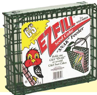
749 • 6/cs. EZ Fill Seed Cake Snak™ Feeder 2 3 / 4 " x 8 3 / 8 " x 7" high Holds 1 ForageCake (2.5 lbs.)