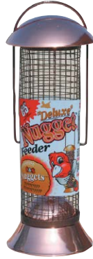
757 • 8/cs. Deluxe Nugget™ Feeder Holds up to 15 oz. 3 7 / 8 " x 3 7 / 8 " x 10 1 / 2 " high