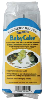
304 • 15 oz. • 8/cs. Farmers' Helper™ BabyCake™