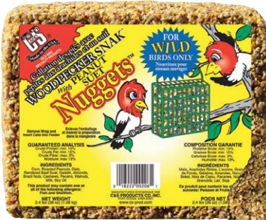
206 • 2.4 lbs. • 6/cs. Woodpecker Snak™ with Peanut Suet Nuggets™ 2 1/4" x 7 5/8" x 6 1/4" high