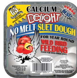
517 • 13 1 / 4 oz. • 12/cs. Calcium Delight