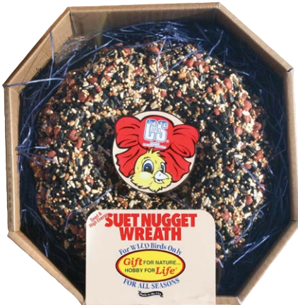
249 • 2.6 lbs. • 4/cs. Suet Nugget™ Wreath 3 1/8" x 10 1/2" x 10 1/2" high