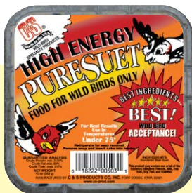
503 • 10 oz. • 12/cs. Pure Suet