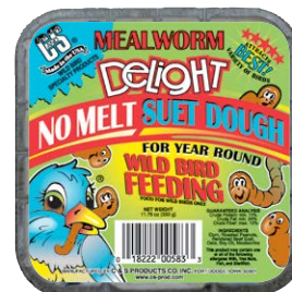
583 • 11 3 / 4 oz. • 12/cs. Mealworm Delight