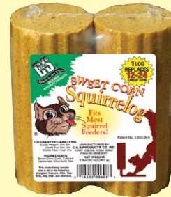
608 • 32 oz. Sweet Corn Squirrellog™ Refill 2/pack • 6 or 12/cs.