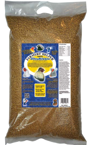
332 • 15 lbs. Farmers' Helper™ UltraKibble™