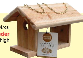
SV109 • 4/cs. Bluebird Feeder 11 7 / 8 " x 9" x 8" high