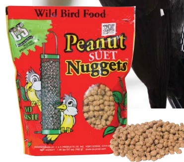
105 • 27 oz. • 6/cs. Peanut Suet Nuggets™