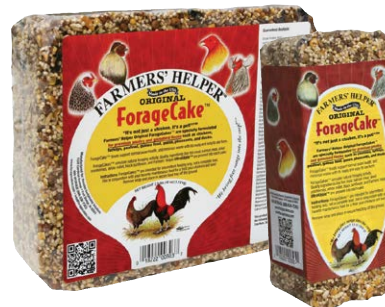
303 • 2.5 lbs. • 6/cs. Farmers' Helper™ Original ForageCake™