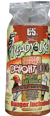
954 • 2 lbs. • 8/cs. Hot Pepper Delight Log