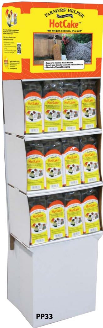
12 3 / 8 " d x 13 3 / 4 " w x 53" h