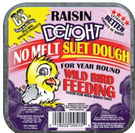
515 • 11 3 / 4 oz. • 12/cs. Raisin Delight