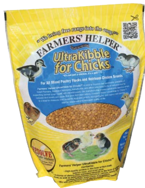
335 • 36 oz. • 6/cs. Farmers' Helper™ UltraKibble for Chicks™