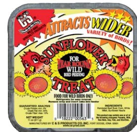
563 • 11 oz. • 12/cs. Sunflower Treat