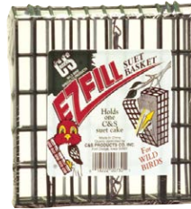
730 • 8/cs. Green EZ Fill Suet Basket 1 3 / 4 " x 4 3 / 4 " x 5 5 / 8 " high Holds 1 Cake