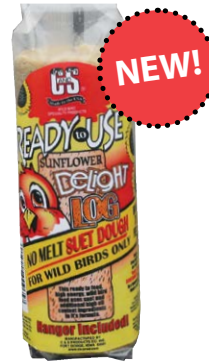
965 • 16 oz. • 8/cs. Sunflower Delight Log