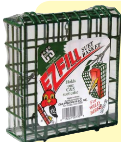
730 • 8/cs. Green EZ Fill Suet Basket 1 3 / 4 " x 4 3 / 4 " x 5 5 / 8 " high Holds 1 Cake