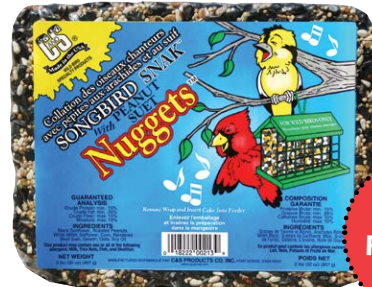
213 • 2 lbs. • 6/cs. Songbird Snak™ with Peanut Suet Nuggets™ 2 1/4" x 7 5/8" x 6 1/4" high