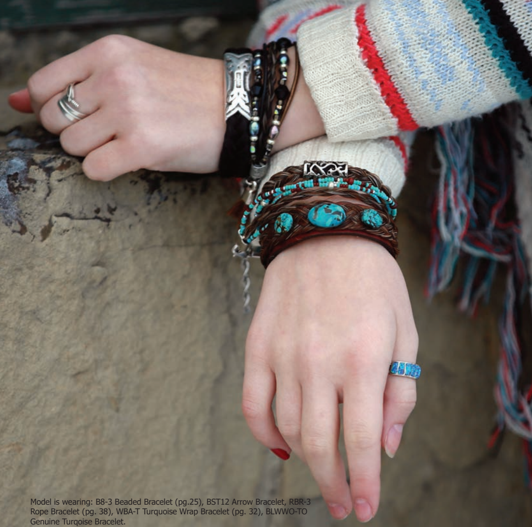
Model is wearing: B8-3 Beaded Bracelet (pg.25), BST12 Arrow Bracelet, RBR-3 Rope Bracelet (pg. 38), WBA-T Turquoise Wrap Bracelet (pg. 32), BLWWO-TO Genuine Turquoise Bracelet.

M magnetic clasp bracelets are our signature product. Braided horse hair is decorated with a variety of metal accents and finished with a sturdy magnetic clasp. Shipped in assorted horse hair colors. Available sizes: Small (7 inches), Medium (8 inches), and Large (9 inches). Unisex. Gift boxed.