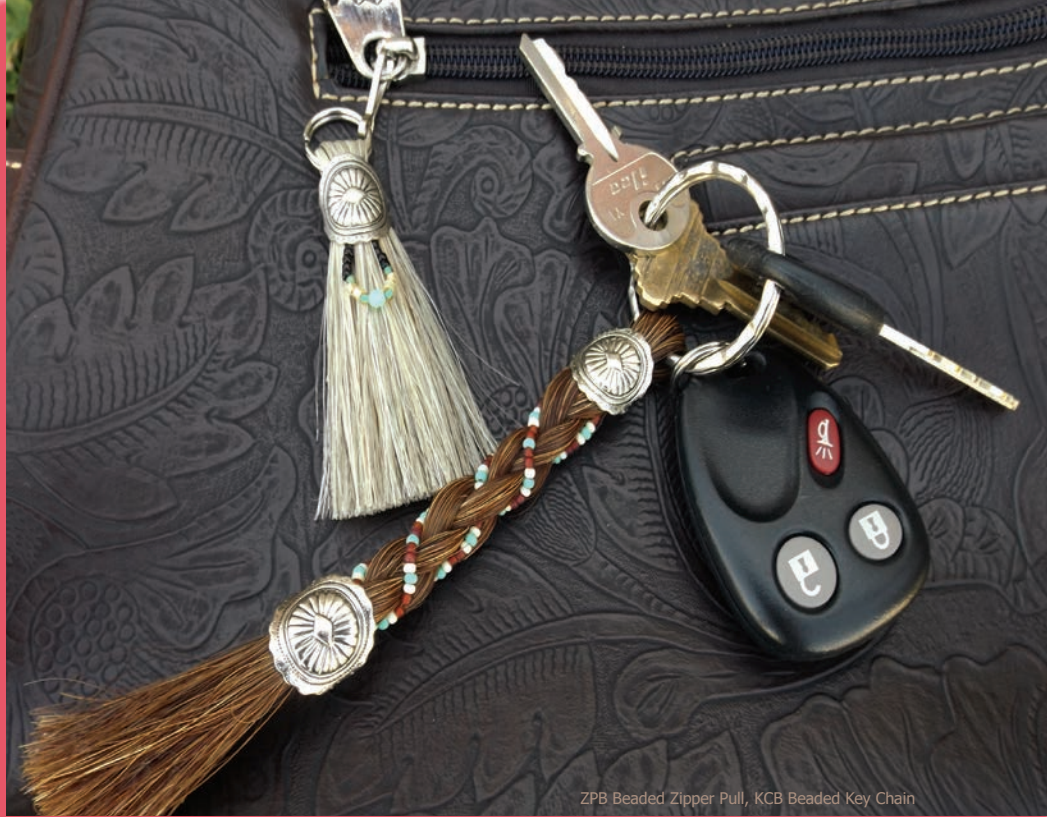
ZPB Beaded Zipper Pull, KCB Beaded Key Chain

This simple fan of authentic horse hair is a great addition to jackets, handbags, backpacks, or luggage. Each zipper pull is adorned with a sunburst metal concho and sturdy hook. Sold in increments of six and shipped in assorted horse hair colors. 2 x 2 1/4 inches long.