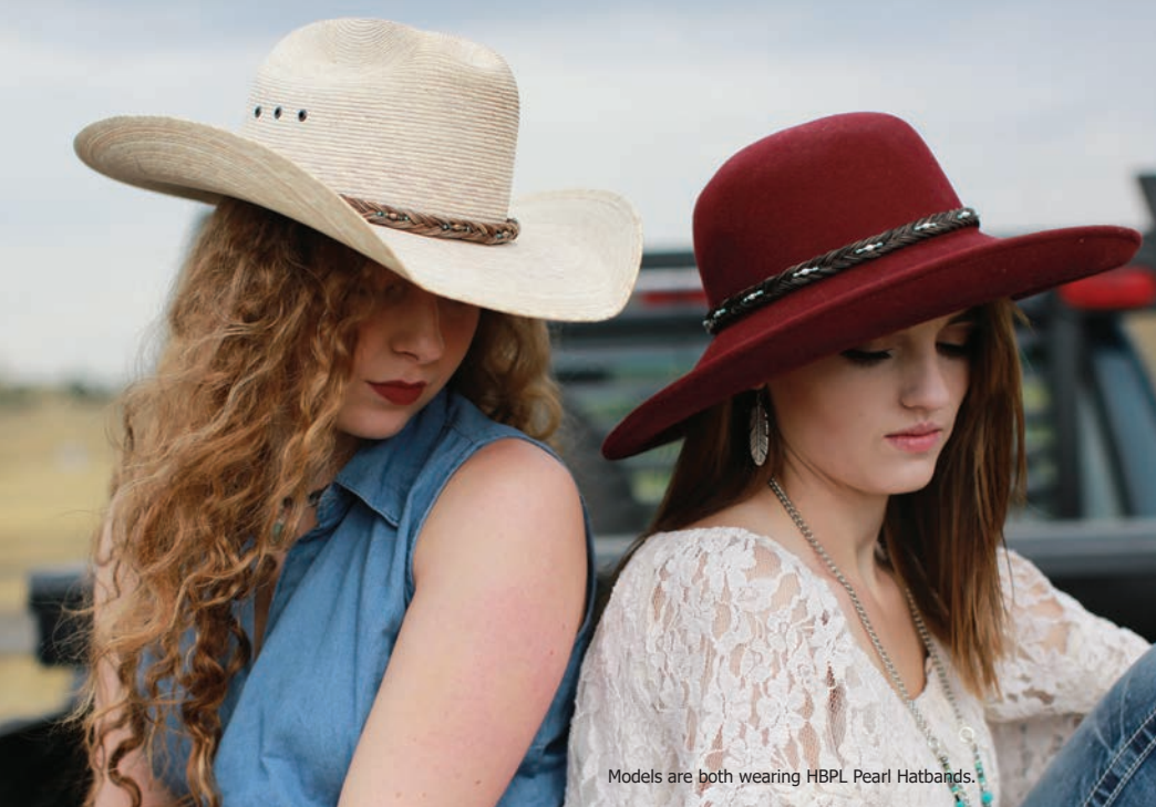
Models are both wearing HBPL Pearl Hatbands.