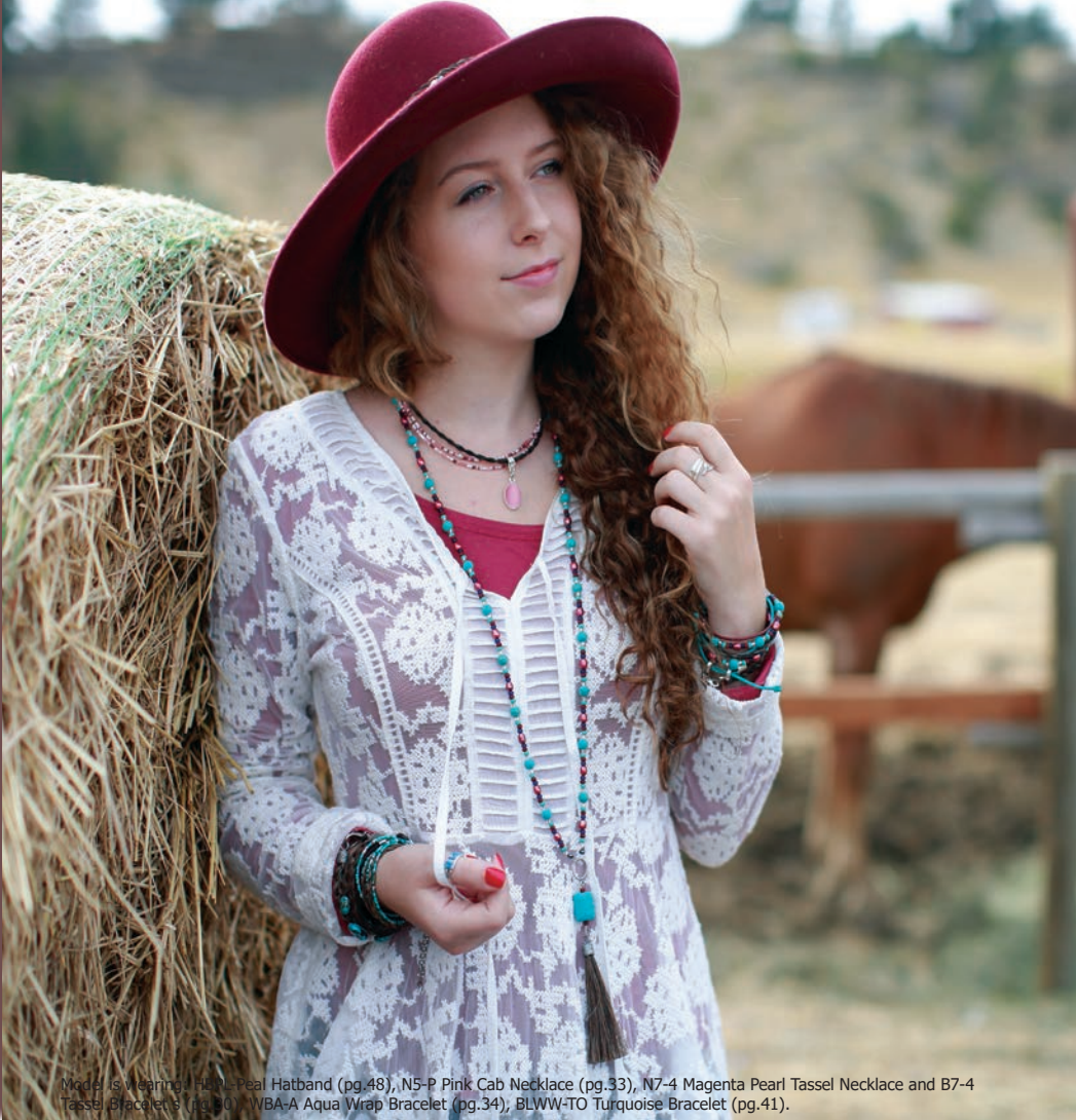
Model is wearing: N4-Pearl Hatband (pg.48), N5-P Pink Cab Necklace (pg.33), N7-4 Magenta Pearl Tassel Necklace and B7-4 Tassel Bracelets (pg.30), WBA-A Aqua Wrap Bracelet (pg.34), BLWW-TO Turquoise Bracelet (pg.41).