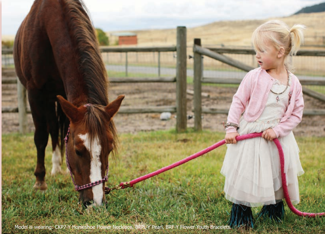
Model is wearing: CKP7-Y Horseshoe Flower Necklace, BRPLY Pearl, BRF-Y Flower Youth Bracelets.