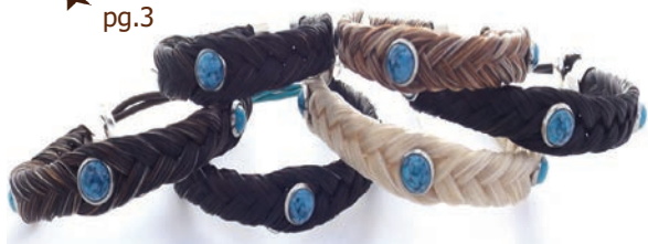
★ BRG-Y pg.3