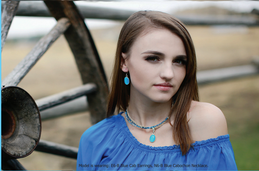
Model is wearing: E6-B, Blue Cab Earrings, N6-B Blue Cabochon Necklace.