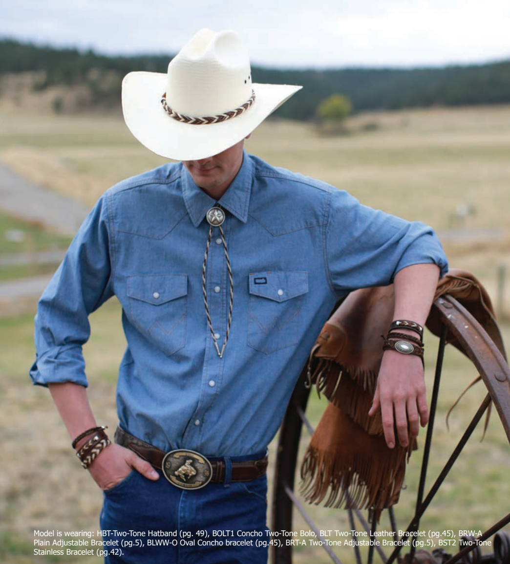
Model is wearing: HBT-Two-Tone Hatband (pg. 49), BOLT1 Concho Two-Tone Bolo, BLT Two-Tone Leather Bracelet (pg.45), BRW-A Plain Adjustable Bracelet (pg.5), BLWW-O Oval Concho bracelet (pg.45), BRT-A Two-Tone Adjustable Bracelet (pg.5), BST2 Two-Tone Stainless Bracelet (pg.42).

Genuine horse hair strings are sold in either one or two colors of horse hair. Finished with metal tips, bolo concho, and adjustable slide back. Shipped in assorted horse hair colors. 18 inches long. Gift boxed.