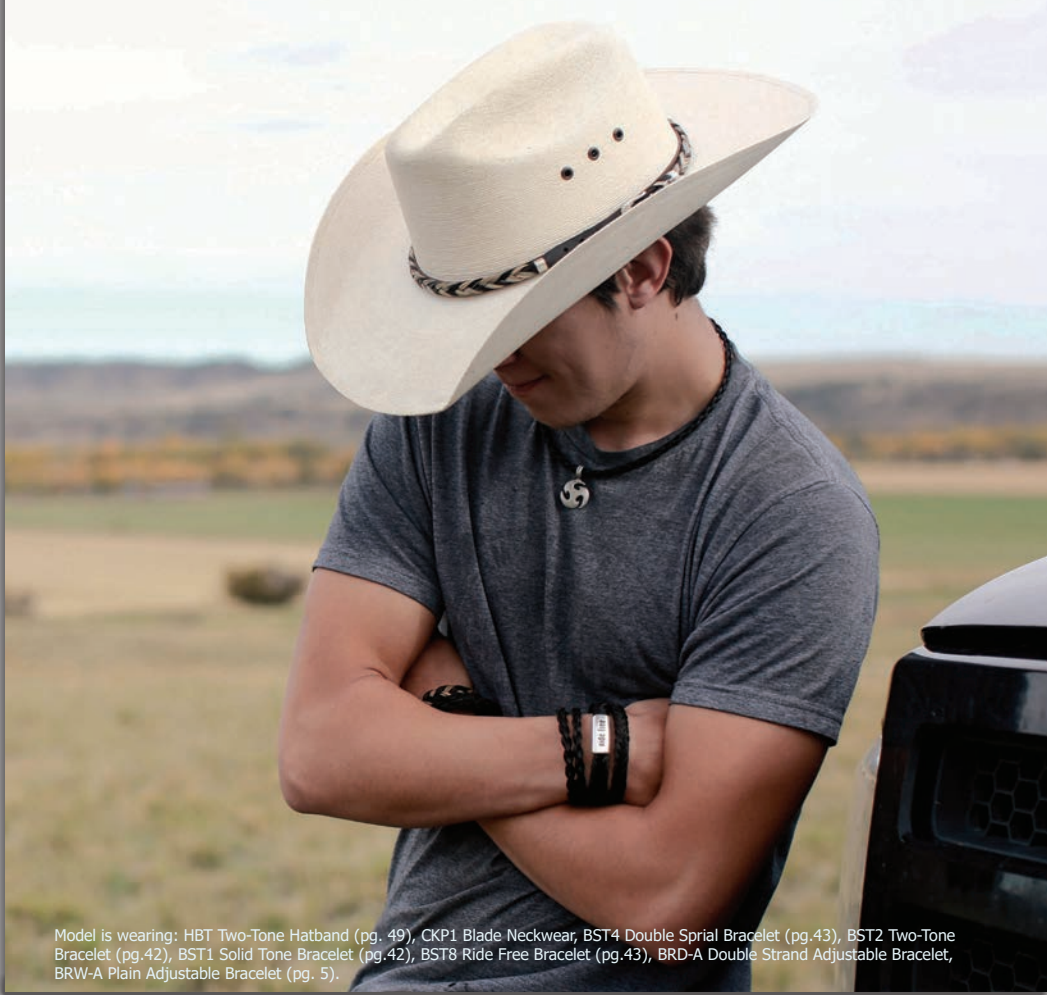
Model is wearing: HBT Two-Tone Hatband (pg. 49), CKP1 Blade Neckwear, BST4 Double Sprial Bracelet (pg.43), BST2 Two-Tone Bracelet (pg.42), BST1 Solid Tone Bracelet (pg.42), BST8 Ride Free Bracelet (pg.43), BRD-A Double Strand Adjustable Bracelet, BRW-A Plain Adjustable Bracelet (pg. 5).