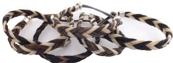
★ BRT-Y pg.5