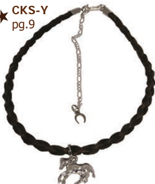
★ CKS-Y pg.9