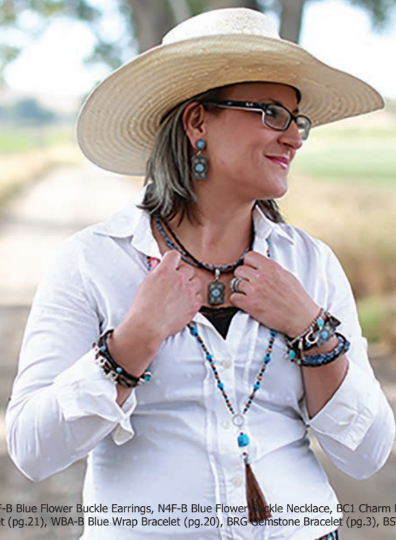
Model is wearing: E4F-B Blue Flower Buckle Earrings, N4F-B Blue Flower Buckle Necklace, BC1 Charm Bracelet (pg. 39), BLWW-B Flower Buckle Bracelet (pg.21), WBA-B Blue Wrap Bracelet (pg.20), BRG Gemstone Bracelet (pg.3), BST11 Running Horse Bracelet (pg.40).