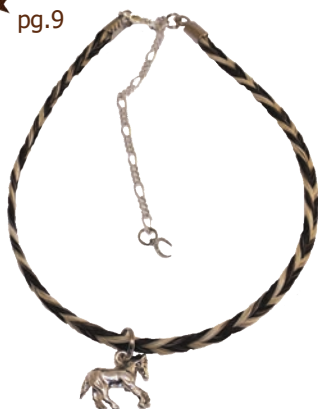
★ CKT-Y pg.9