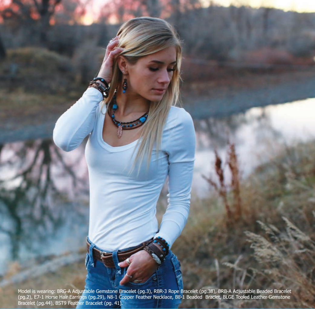
Model is wearing: BRG-A Adjustable Gemstone Bracelet (pg.3), RBR-3 Rope Bracelet (pg.38), BRB-A Adjustable Beaded Bracelet (pg.2), E7-1 Horse Hair Earrings (pg.29), N8-1 Copper Feather Necklace, B8-1 Beaded Bracelet, BLGE Tooled Leather Gemstone Bracelet (pg.44), BST9 Feather Bracelet (pg. 41).

This feather bracelet has a double strand of spiral woven horse hair, accented with a metal feather and finished with a sturdy magnetic clasp. Shipped in assorted horse hair colors.