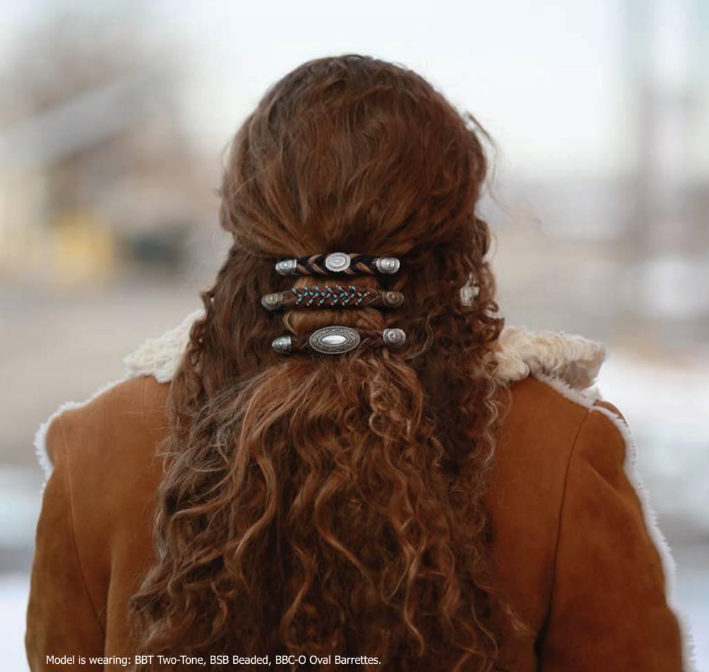
Model is wearing: BBT Two-Tone, BSB Beaded, BBC-O Oval Barrettes.

O ur horse hair barrettes feature a high quality French barrette back. Shipped in assorted horse hair colors. Available sizes: Small (2.75 inches), Medium (3.35 inches), or Large (3.85 inches).