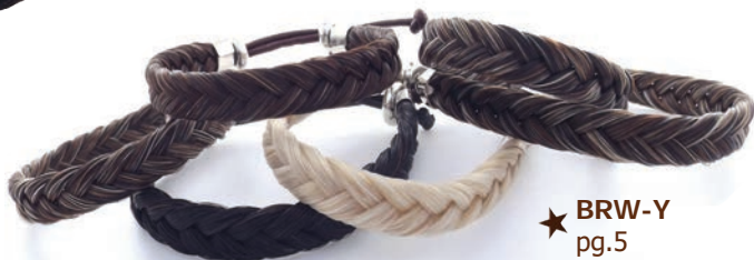
★ BRW-Y pg.5