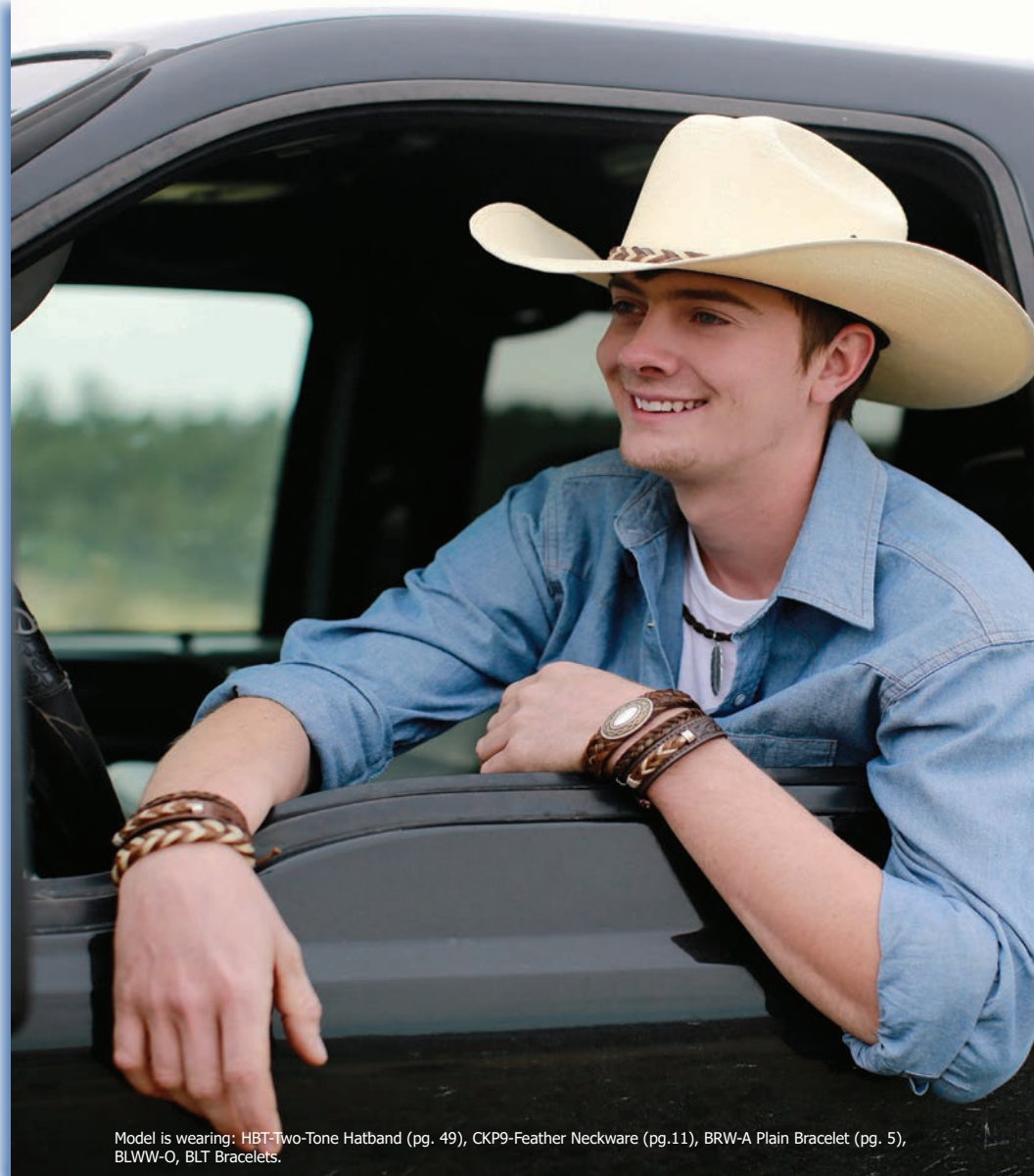
Model is wearing: HBT-Two-Tone Hatband (pg. 49), CKP9-Feather Neckware (pg.11), BRW-A Plain Bracelet (pg. 5), BLWW-O, BLT Bracelets.