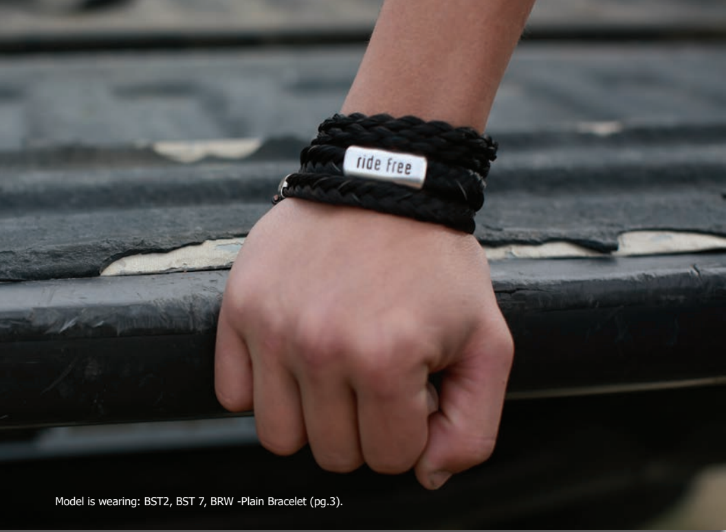
Model is wearing: BST2, BST 7, BRW -Plain Bracelet (pg.3).

The rugged styling of our magnetic clasp horse hair bracelets make this group our best sellers for men. Shipped in assorted horse hair colors. Available sizes: Small (7 inches), Medium (8 inches), and Large (9 inches). Unisex. Gift Boxed.