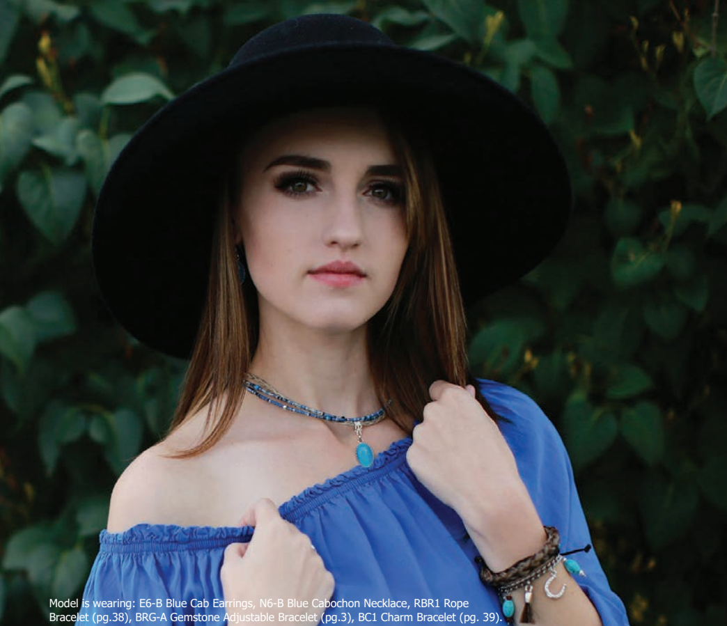
Model is wearing: E6-B Blue Cab Earrings, N6-B Blue Cabochon Necklace, RBR1 Rope Bracelet (pg.38), BRG-A Gemstone Adjustable Bracelet (pg.3), BC1 Charm Bracelet (pg. 39).

Cabochon necklaces feature a spiral braid of horse hair complimented by beads that match a cabochon pendant. These necklaces are available in nine color combinations. Colors are shown here and on following pages. Lobster claw closure. 18 inches long. Hang tagged.