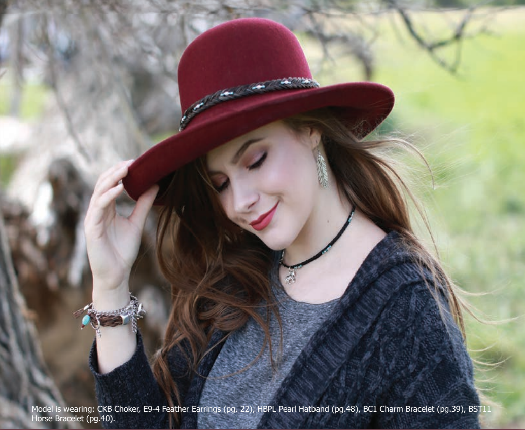
Model is wearing: CKB Choker, E9-4 Feather Earrings (pg. 22), HBPL Pearl Hatband (pg.48), BC1 Charm Bracelet (pg.39), BST11 Horse Bracelet (pg.40).

These lovely loops of horse hair are worn as a choker by fashion forward cowgirls. Select styles are accented with seed beads, pearls, or faux turquoise and most include a horse charm. Each choker includes an adjustable chain. Shipped in assorted horse hair colors. Adjusts from 13 to 17 inches.