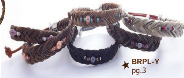
★ BRPL-Y pg.3