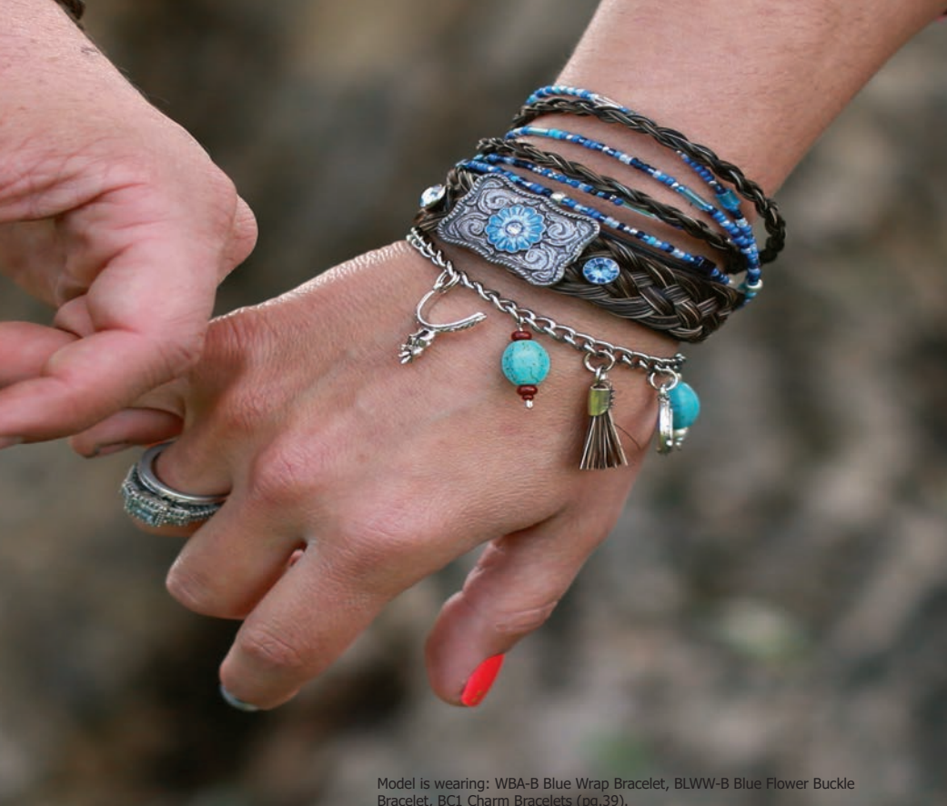
Model is wearing: WBA-B Blue Wrap Bracelet, BLWW-B Blue Flower Buckle Bracelet, BC1 Charm Bracelets (pg.39).

W rap bracelets lap twice around your wrist for a layered look. These adjustable bracelets have a three-inch chain and lobster claw closure. One size fits all.