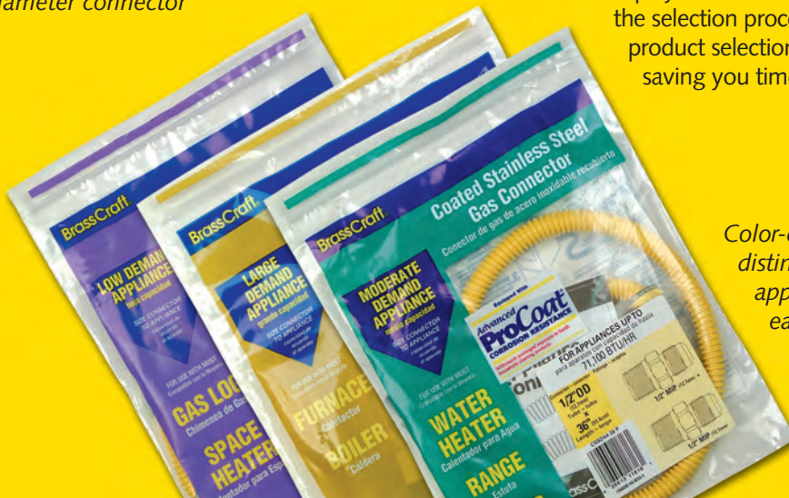
Color-coded packaging distinguishes products by application for quick and easy product selection.

Designed from consumer research, our ProCoat packaging distinguishes products by application and prominently displays the information required to make a sound purchase decision. Easy-view, reclosable bags allow the connector and fittings to be seen, handled and returned to the packaging without damage to the product or package. Combined, these features create a user-friendly display that stimulates sales while making the selection process simple. Accurate product selection reduces product returns, saving you time and money.