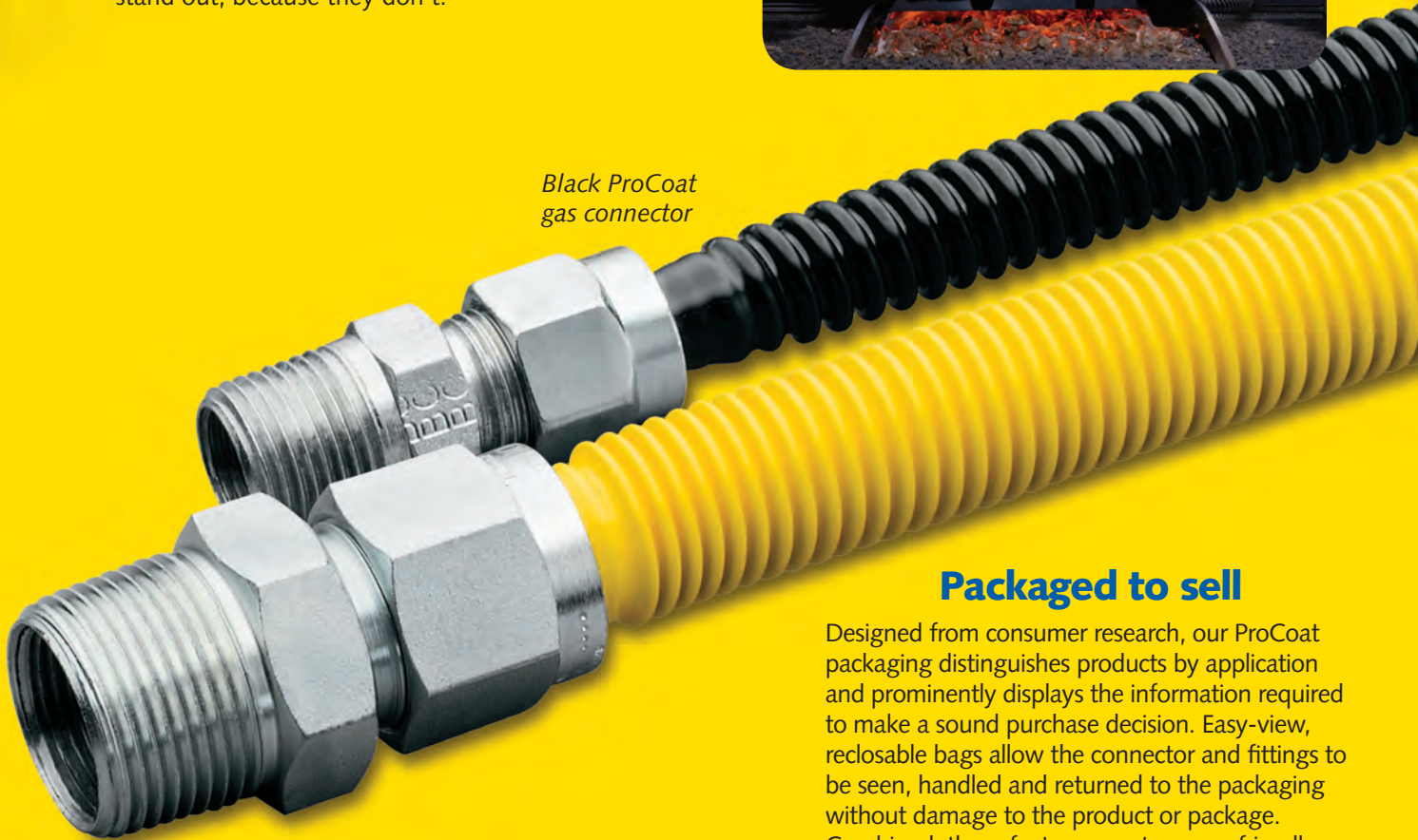
ProCoat large diameter connector