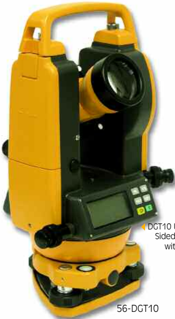
▼ DGT10 Units have Dual Sided LCD Displays with Controls