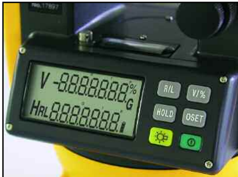
Easy-to-Read LCD Display

56-DGT10 Berger 10 second Digital Theodolite