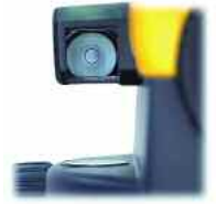
Right Angle Penta Prism for Easy Bubble Viewing