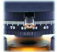
Compensator Lock Protects Instrument During Transport