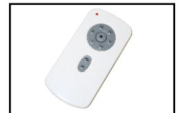
Remote Control Included with Wall Holder

VENTAMATIC, LTD. P.O. BOX 728, MINERAL WELLS, TX 76068 • PHONE 800-433-1626 • WWW.BVC.COM