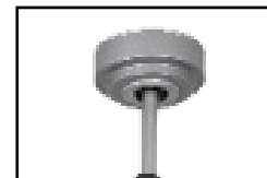
6" Downrod Included