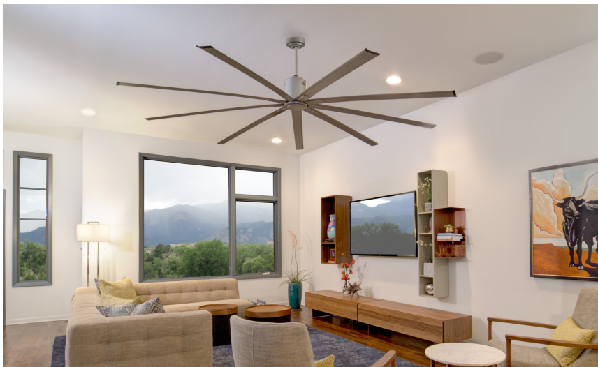
Product made in Taiwan.