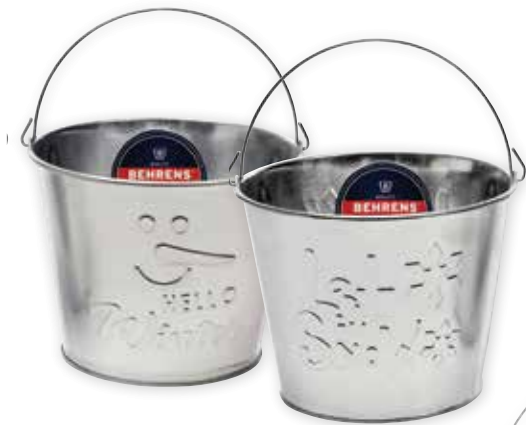
← embossed seasonal bundle →