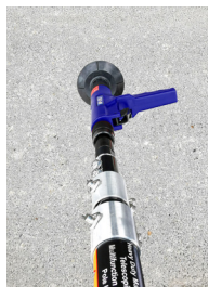
Overhead Hanging Applications