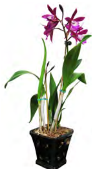
Cattleya in 5" Ceramic Pot (also available in plastic pot upon request) Item #: 23148 Pack: 6/case