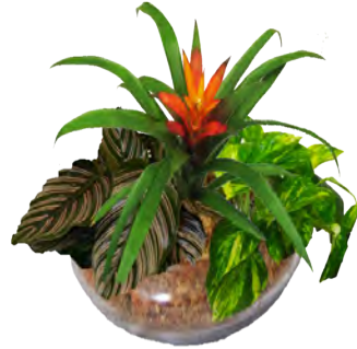
Small Foliage Bowl Item #: 40080 Pack: 4/case