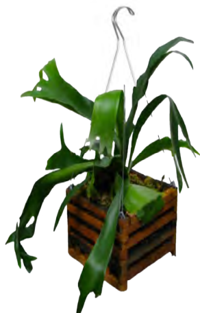
Staghorn Fern in 8" Hanging Basket Item #: 70130 Pack: 4/case