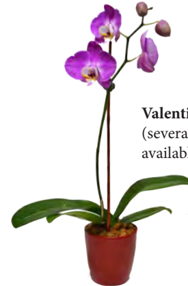
Valentine's Arrangements (several different arrangements available)