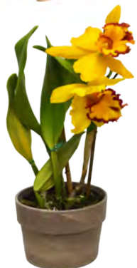
Cattleya in 6" Clay Pot Item #: 23179 Pack: 6/case