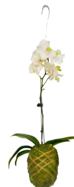
1 pt Hanging Phalaenopsis in Moss Item #: 23510 Pack: 12 /case