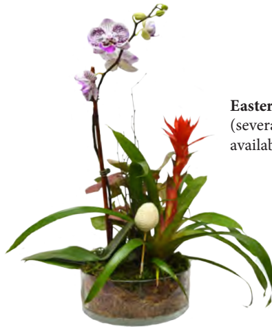
Easter Arrangements (several different arrangements available)