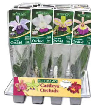
2" Packaged Cattleya in Tray