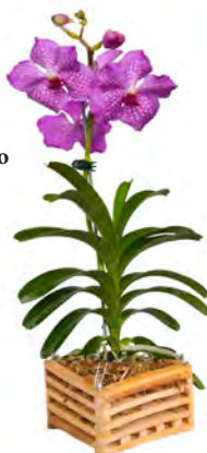
Vanda in 6" Wood Basket Item #: 23321 Pack: 6/case