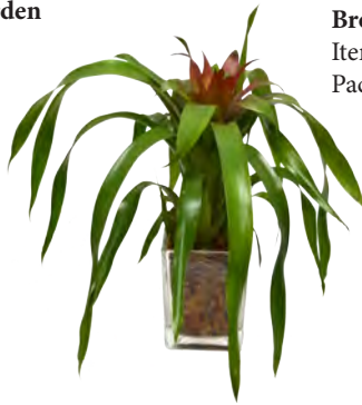
Bromeliad in Designer Planter Item #: 40011 Pack: 12/case