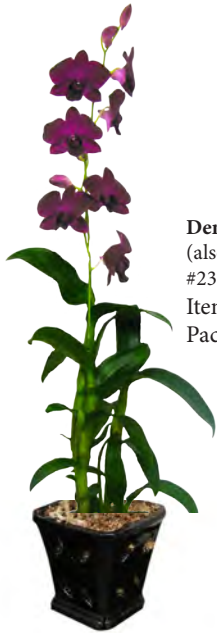
Dendrobium in 4" Ceramic Pot (also available in plastic pot #23650) Item #: 23233 Pack: 12/case

All orchids come in assorted colors Availability of orchids vary by species based on blooming season