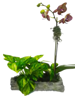
Phal Combo in Driftwood Item #: 24410 Pack: 3 /case