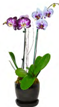
Multi Phal in Bonsai Pot Item #: 23280 Pack: 4/case