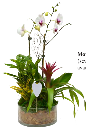
Mother's Day Arrangements (several different arrangements available)