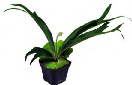
1.0 Pt. Staghorn Fern Item# 70050 Pack: 15/Case