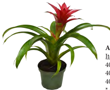
Asst. Bromeliad in plastic pot