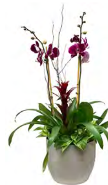
Willow Arrangement Item #: 24030 Pack: 1/case