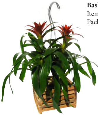
Bromeliad in 8" Hanging Basket Item #: 40060 Pack: 4/case