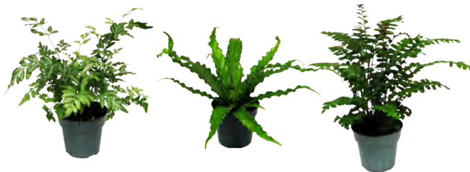
1.0 Pt. Assorted Exotic Ferns Item# 70820 Pack: 15/Case