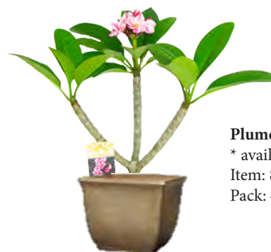
Plumeria in 7" Planter * available May - July Item: 80232 Pack: 4/case