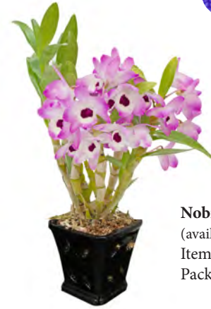
Nobile in 5" Ceramic Pot (available January - March) Item #: 23149 Pack: 6/case