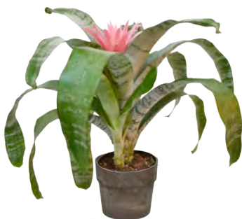
6" Fasciata in Clay Pot * available Oct. - May Item: 40541 Pack: 6/case