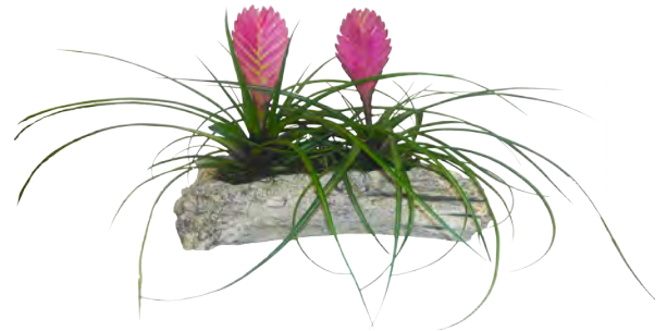
Bromeliad Driftwood Item #: 40560 Pack: 3/ case