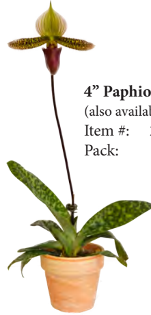
4" Paphiopedilum in Clay Pot (also available in plastic pot #23609) Item #: 23606 Pack: 12/case