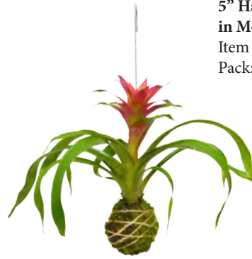
5" Hanging Bromeliad in Moss Item #: 40120 Pack: 12 /case