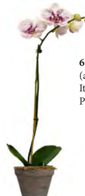
6" Phalaenopsis in Clay Pot (also available in plastic pot #23200) Item #: 23129 Pack: 12/case