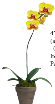
4" Phalaenopsis in Clay Pot (also available in plastic pot) (#23104) Item #: 23109 Pack: 12/case

All orchids come in assorted colors Availability of orchids vary by species based on blooming season