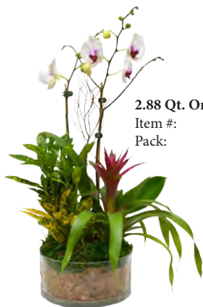
2.88 Qt. Orchid Garden Combo Item #: 23196 Pack: 4/case