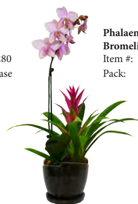
Phalaenopsis & Bromeliad Combo Item #: 23250 Pack: 6/case