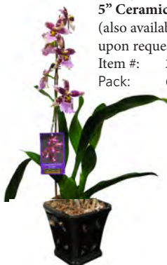
Intergeneric in 5" Ceramic Pot (also available in plastic pot upon request) Item #: 23147 Pack: 6/case