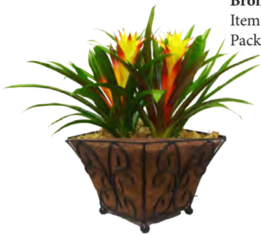
Bromeliad Large Garden Item #: 40559 Pack: 4/case