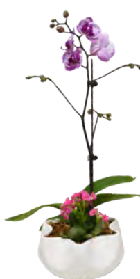
Phalaenopsis & Foliage Combo 4" Phalaenopsis, Foliage & Huck Branch (available in assorted colors) Item #: 23210 Pack: 6/case