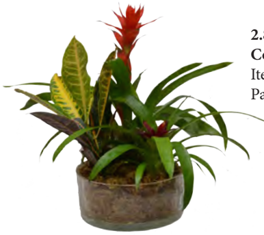
2.88 Qt. Bromeliad Combo Item #: 40030 Pack: 4/case